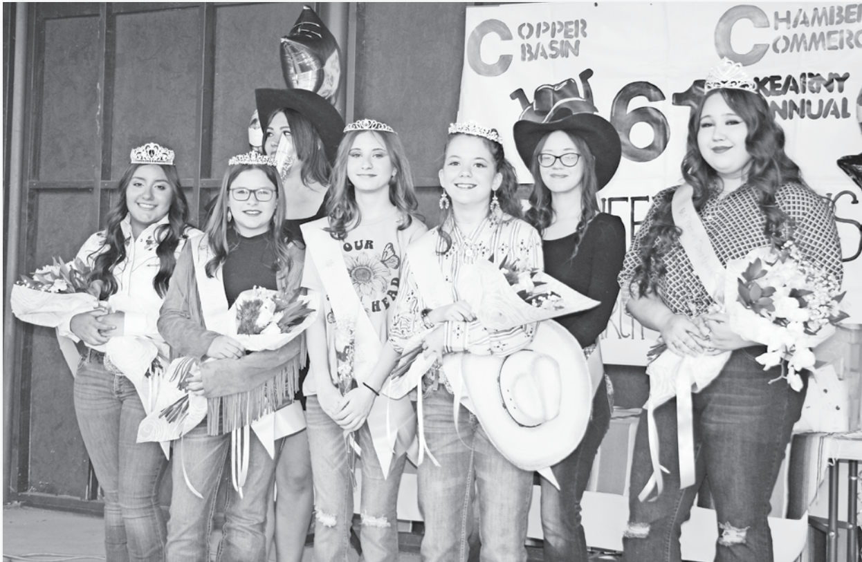
2023 Pioneer Days Queen and Junior Queen along with the Princesses.