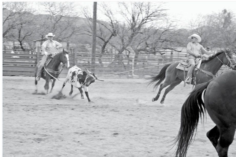
So many fun events to experience at Kearny's Pioneer Days. The event boasted a softball tournament, horseshoes and roping.