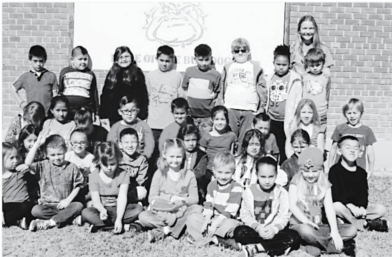
First Grade Bulldogs have collected money for Girl Scout cookies for troops serving overseas for the third year.

Copyright © Medico Insurance Company 11F-633(AZ) 34 114 3788 031314 AZ