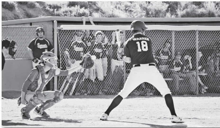
The ball heads straight for the catcher's glove.