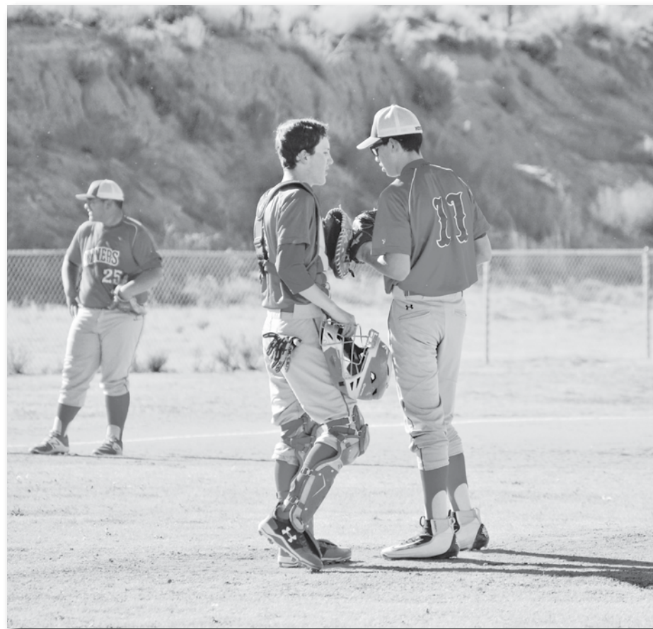
San Manuel's pitcher and catcher confer during a game against Ray last week.