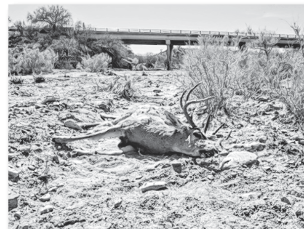
Mule deer killed near San Manuel.

The Arizona Game and Fish Department has trust responsibility for managing more than 800 native wildlife species – the most of any inland state – for current and future generations of Arizona citizens. bit.ly/2mouR8P