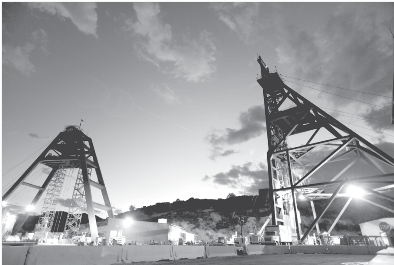
The U.S. Forest Service will be hosting two workshops, the next step in the permitting process for Resolution Copper Company.