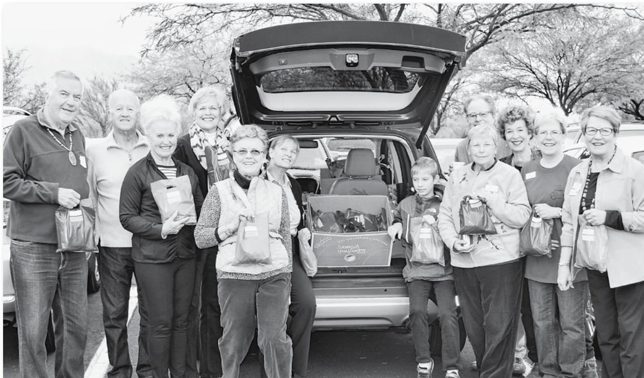
Members of the Mountain Shadows Presbyterian Church with donations collected for the Tri-Community Food Bank.

Mountain Shadows Presbyterian Church, located in Catalina, has a mission statement that says: Centered in Christ, Caring for Community. For several years this local church has dedicated a specific day to enact that statement and February 19 was such an event.