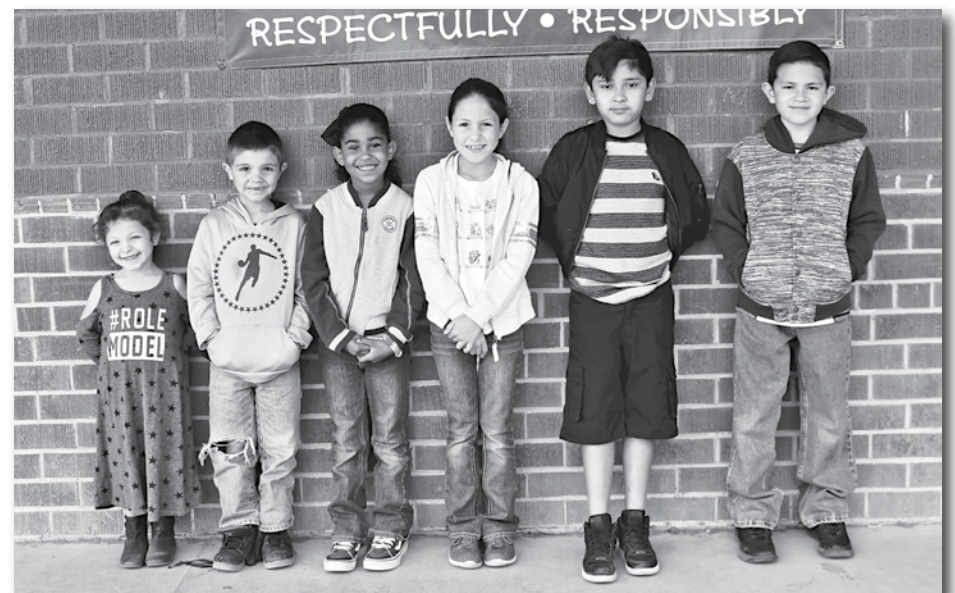
Mammoth Elementary STEM School Student of the Month.