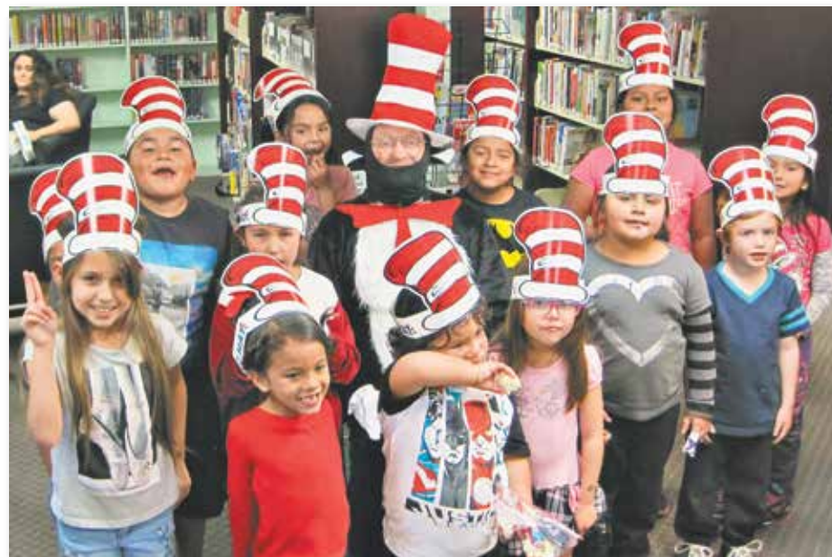
Kids had fun with the Cat in the Hat at the San Manuel Library.