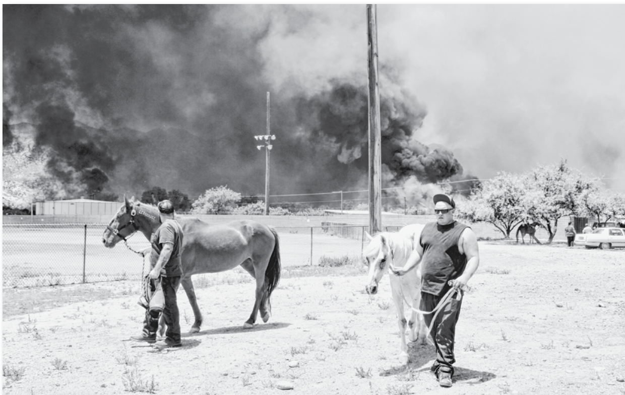
The Oracle Fire Department and Firewise want to make sure the community has the evacuation plan down in the event of a wild fire.

For more information, go to www.oraclefire.org .