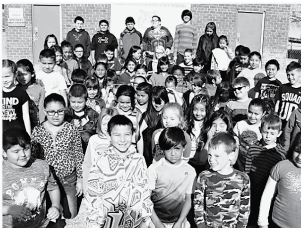
Students at First Avenue Elementary school teamed up with San Manuel Junior-Senior High School students and staff to send more than 150 boxes of Girl Scout cookies to armed forces serving overseas.

Have a service man or woman you’d like us to recognize? We are proud to support our military and will publish the information at no charge. Email information to: cbnsun@minersunbasin.com