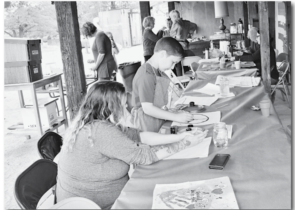
Local artists gathered at the Triangle L Ranch to create Art for Peace.

The artwork will be on display at the Triangle L Ranch in April including during the Oracle Studio Art Tour. The week of April 23 – 30, the work will be shipped to the group that Oracle has been matched with. Messages of peace will be simultaneously circling the globe. Oracle will be sending some love!