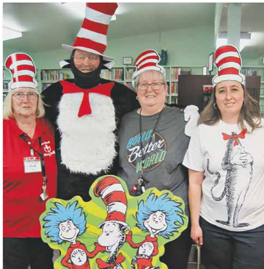
The staff also had fun with the Cat in the Hat at the San Manuel Library.