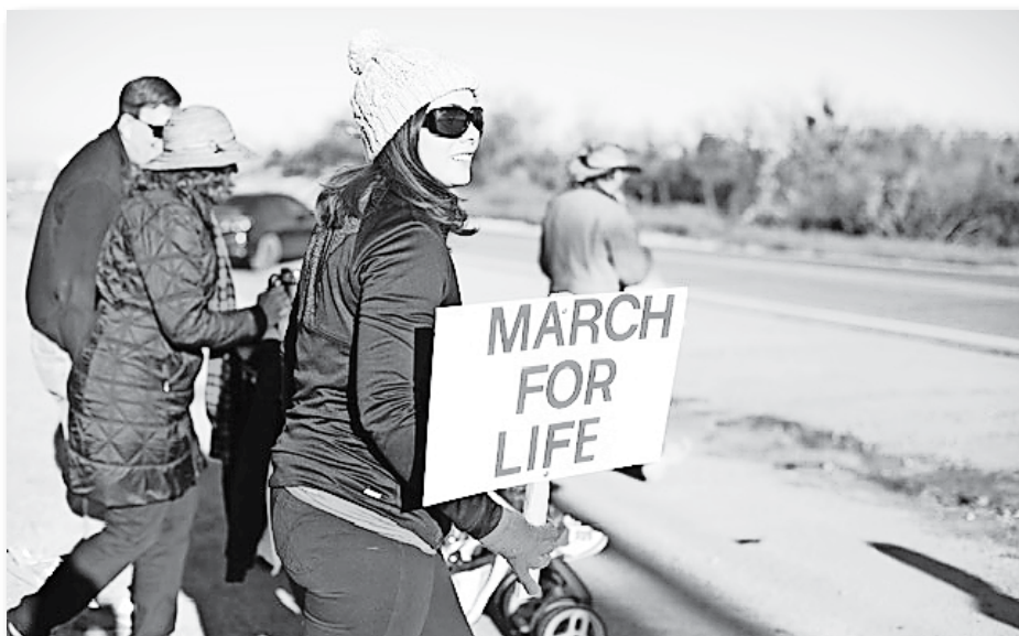
Folks walk in the Family First Pregnancy Care Center's March for Life this weekend.

Walk for Life and Family First are doing great work in the Tri-Community