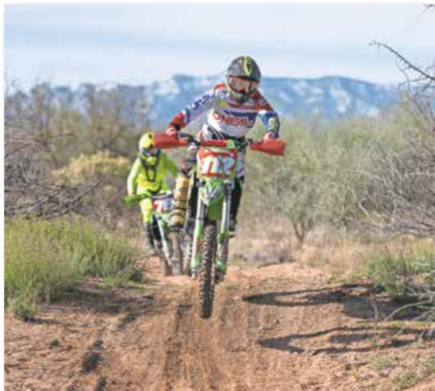
Vince Apuron | Apuron Photography