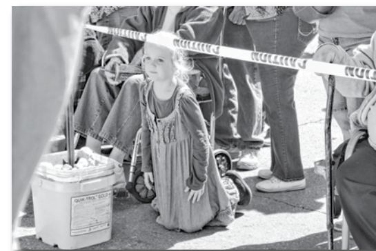
Cheering on the Chihuahuas