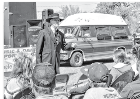
Wyatt Earp Performs