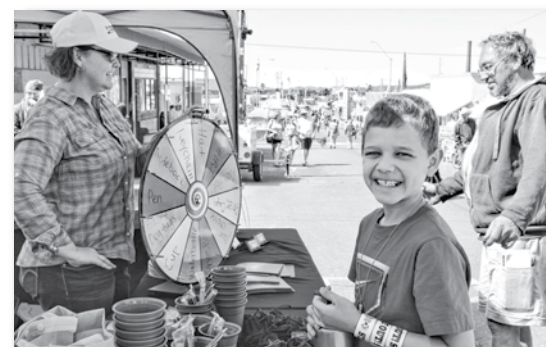
Enjoying the fun