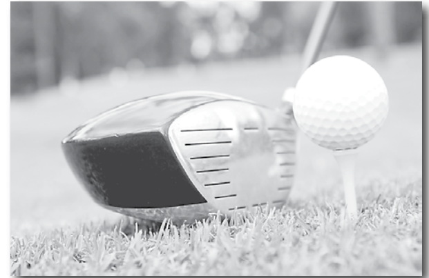
Get set to tee up April 5 at the SaddleBrooke West Golf Course.