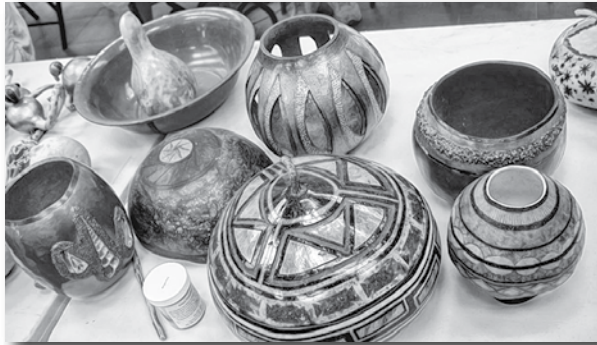
Examples of gourd art

Boyce Thompson Arboretum (BTA) winter events showcased the Australian gardens and plants of Southern Africa; eucalyptus and gum trees, colorful aloes that thrive in our desert climate. Visitors marvel at mature examples of these plants and trees throughout the gardens. You can purchase your own during the coming month, at the BTA annual Spring Plant Sale fundraiser, which will offer a stunning selection of plants for sale from March 8-23. This month is also a prime time to buy an annual membership at BTA. Annual members save 20 percent on plant purchases during the fundraising sales.