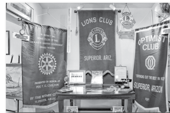
Service Organizations Display