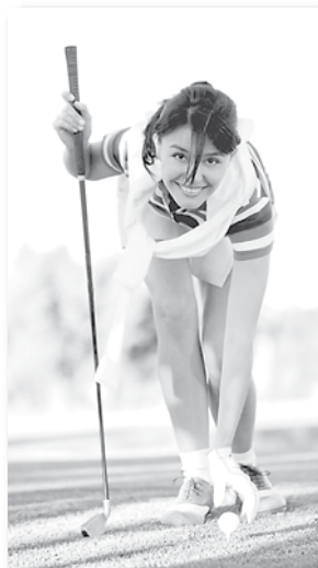
Try for a hole in one!