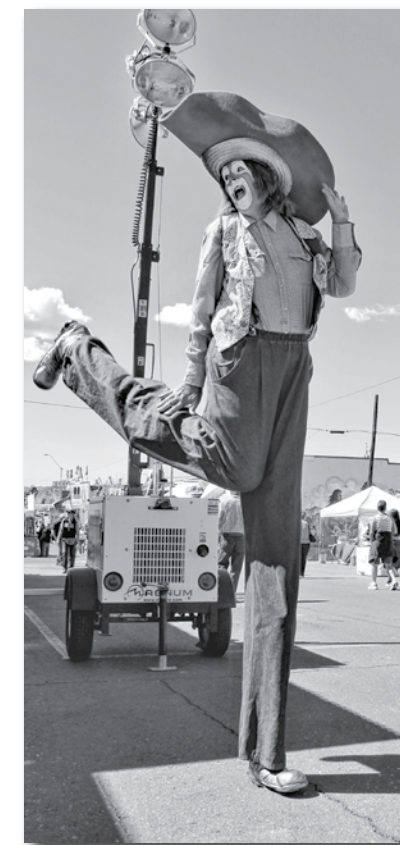
Kosmos wows on stilts!