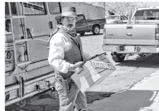
Real miners use TNT