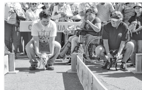
The championship race