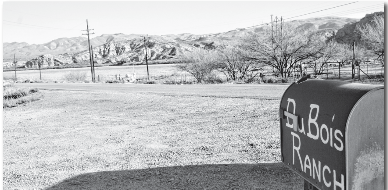
Crescent Ranch can be seen from the entrance of the DuBois Ranch.