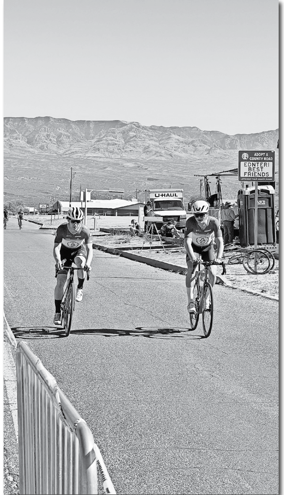
On Sunday, Feb. 5, San Manuel played host to time trials and the Explore Pinal County presents the 2023 La Vuelta a Santa Catalina: La Clásica San Manuel (criterium).