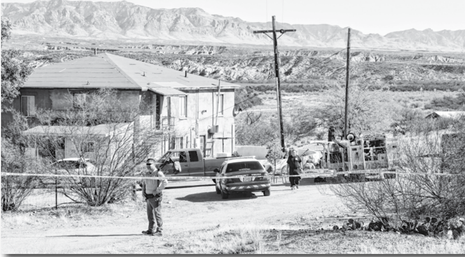
Mammoth Police and Fire and Pinal County Sheriff's Deputies await the arrival of homicide detectives at the scene of a double homicide.