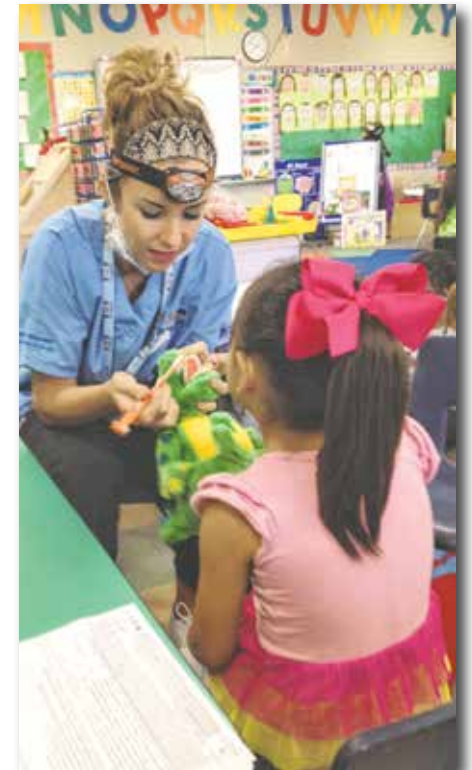
Teaching a child the proper way to brush her teeth.