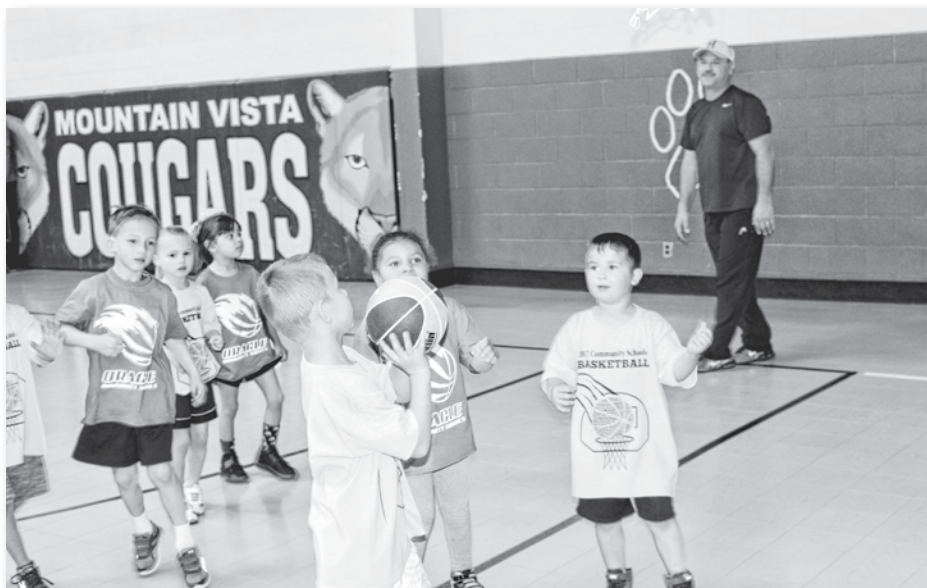
The Mammoth-San Manuel Community School kicked off its basketball season Saturday February 4 at the Mt. Vista School gym in Oracle. Kids will be playing in Kearny at the Ray High School and Jr. High gyms.