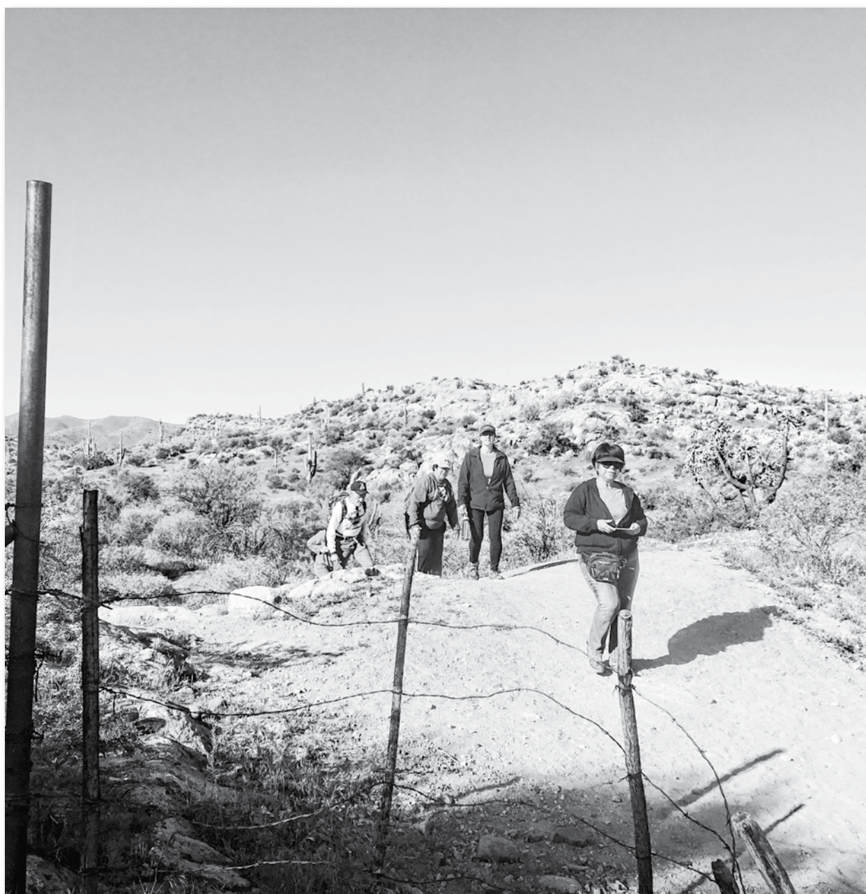
Hikers on the LOST heading to Arnett Canyon.

Enter to win now, go to: www.pulsepoll.com