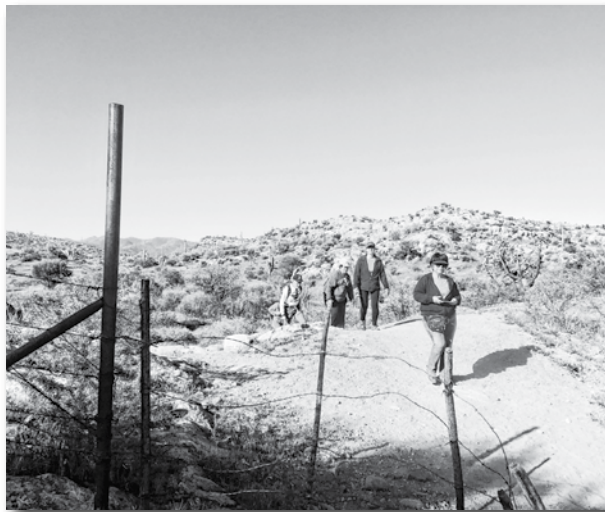
Many hikes along the Arizona Trail and Legends of Superior Trails are planned for his weekend.