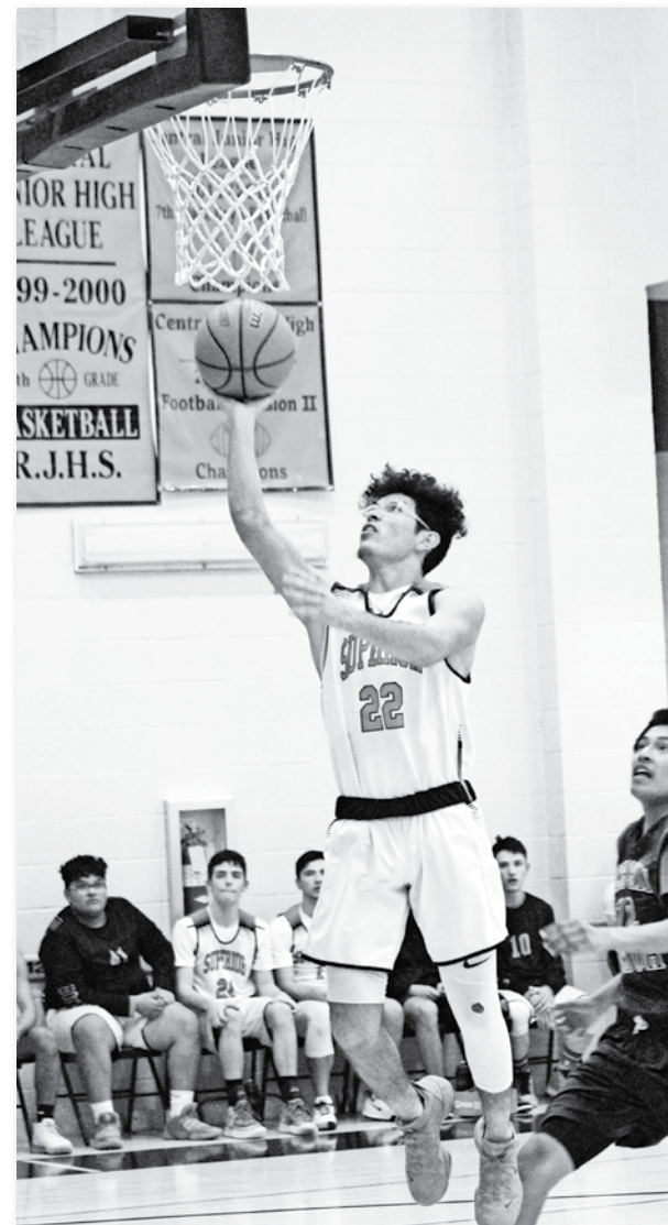
Going for the score. Superior's #22 puts one in the basket.