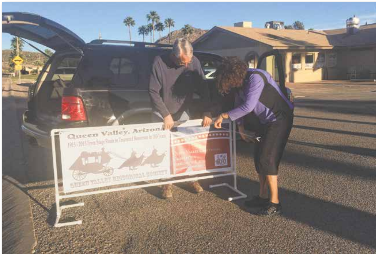
Event coordinators prepare the town of Queen Valley for the weekend's celebration.

Be sure to check out the schedule of events in the ad in this issue of the Superior Sun. Please, go to the party. And please when you go, find someone who lives there and tell them "Happy Birthday!"