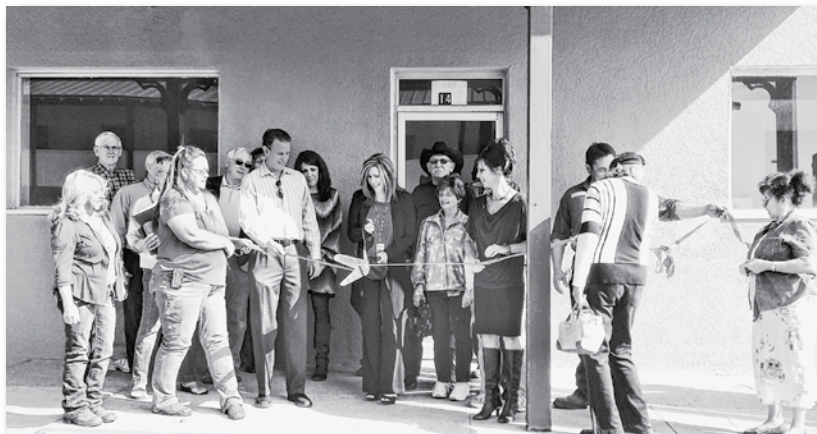
Superior Chamber officially welcomes Gemini Hospice to town.

They plan on offering grief counseling group sessions and will be doing outreach to local veterans as well as providing blood pressure checks at local senior centers. The staff there wants to invite everyone to stop in and visit with them and learn more about their