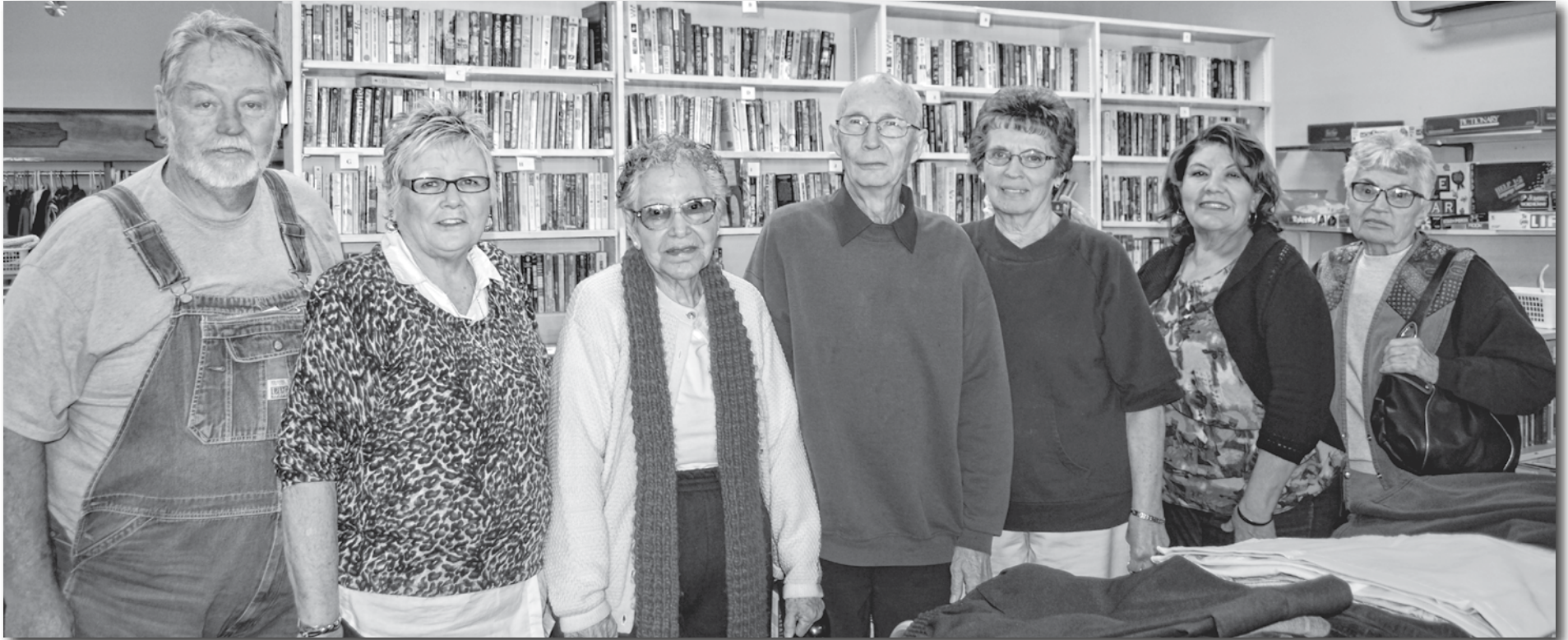
Volunteers at the San Manuel Historical Society Thrift Shop stand ready to serve. Why not stop by and check out the store?