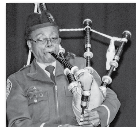
A retired DOC Officer played Amazing Grace on the bagpipes.