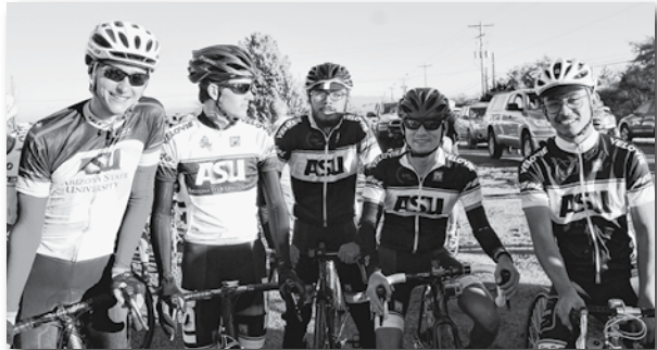
ASU Cycling Team.