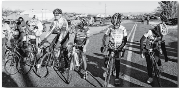
Juniors category ages 9 - 12 are ready to start the race.