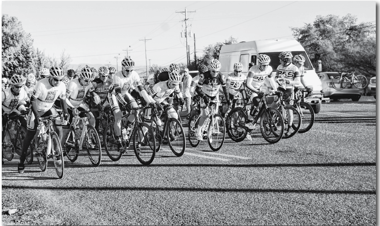
Start of the 2015 UA Cycling Oracle Road Race. Pictured is the first group out.