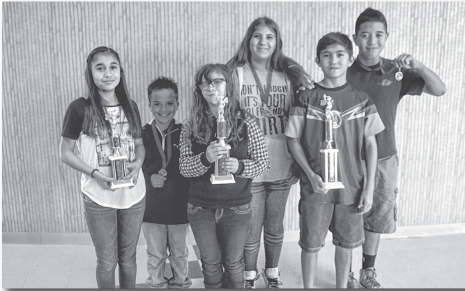
Winners of the Mammoth-San Manuel District Spelling Bee. Good luck to those heading to the County Bee.