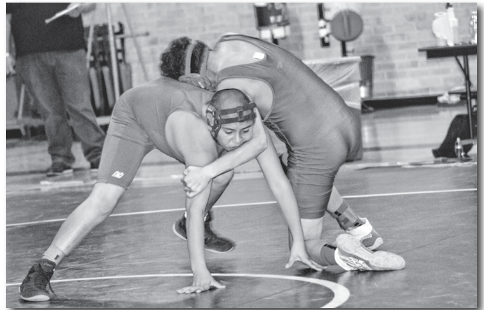
Hayden wrestlers at the Central Junior High League Championships.