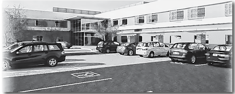
An artist's rendering of the planned expansion.

The $28 million expansion project will provide the region with a modern, state of the art medical facility, improve access to local healthcare, enhance the patient and family experience and will be a healthcare asset to the region. Construction will occur in a three phase plan and completion is estimated to be 20 months.