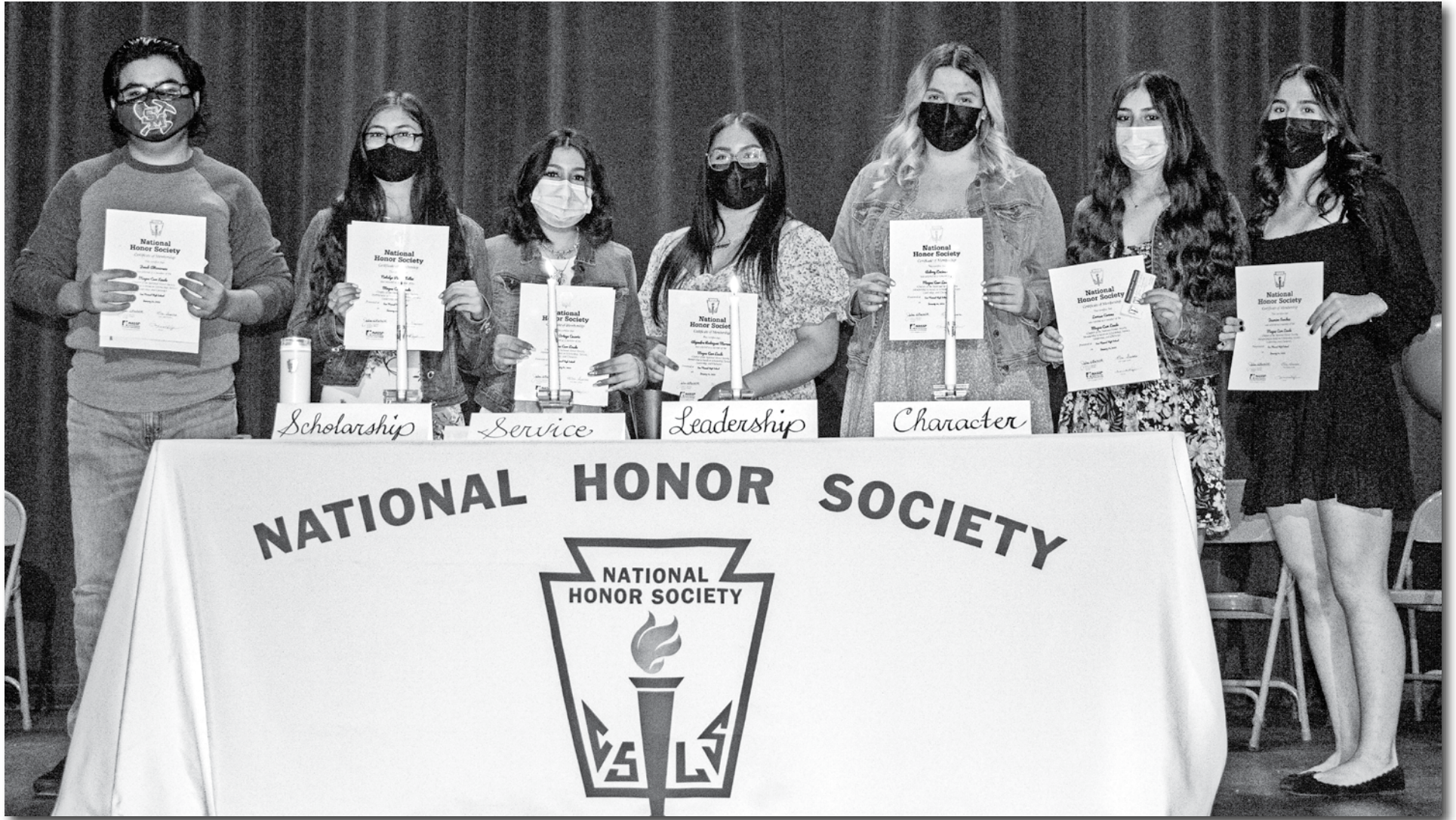
The San Manuel National Honor Society and National Junior Honor Society inducted new members last week in two ceremonies. Above is the high school and below junior high.