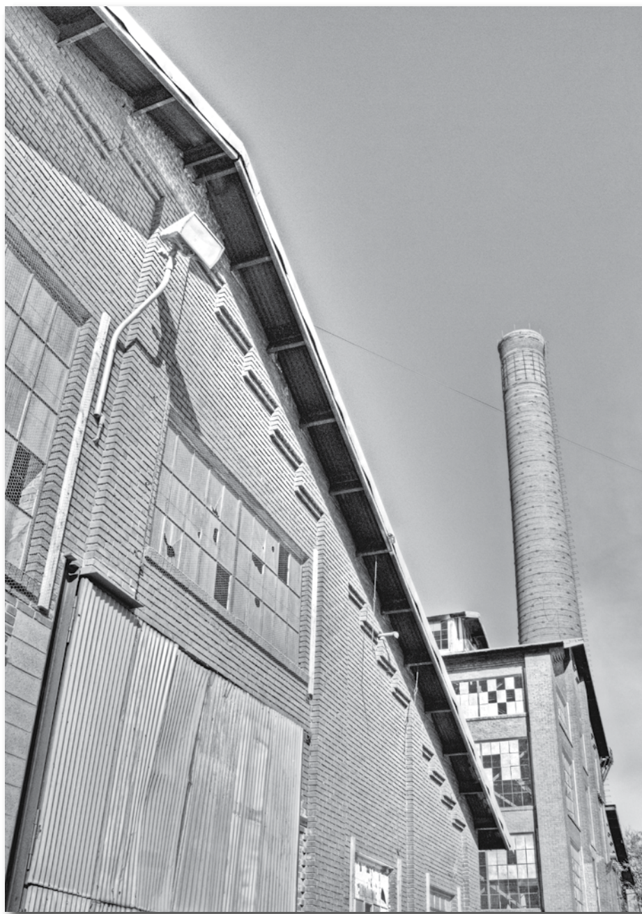
The Magma Smelter in Superior was demolished in 2018, but it represents a rich history of copper mining in the Copper Corridor.