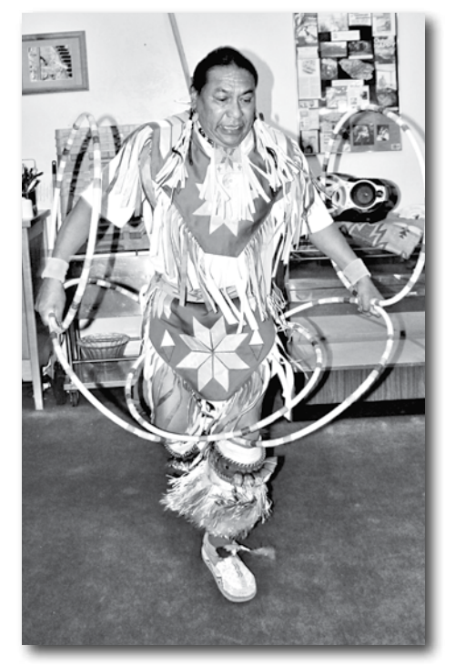
A Native American Hoop Dancer performed during the Buffalo Bill Cody Days at the Oracle Inn.