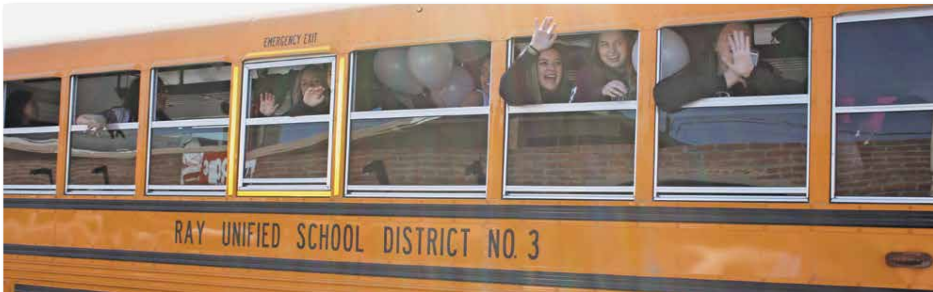
Ray Lady 'Cats wave goodbye to the well-wishers who gathered along Alden Road in Kearny.