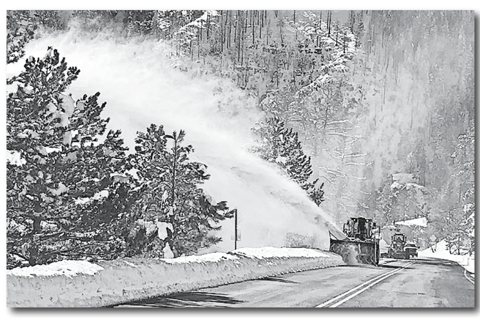
ADOT crews work to clear the snow from Highway 89A near Sedona.

can do about it, including delaying travel until the worst has passed.