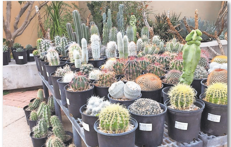
Succulents on sale at the Boyce Thompson Arboretum.

Boyce Thompson Arboretum is located just outside of Phoenix, Arizona, in the stunning Superstition Mountains. Founded in 1924, the arboretum sits on 343 acres and features 18,900 desert plants from around the world. Admission is $15 for adults, and $5 for children. There is no admission necessary to shop at the plant sale. Dogs are welcome. Visit www.btarboretum.org for more information.