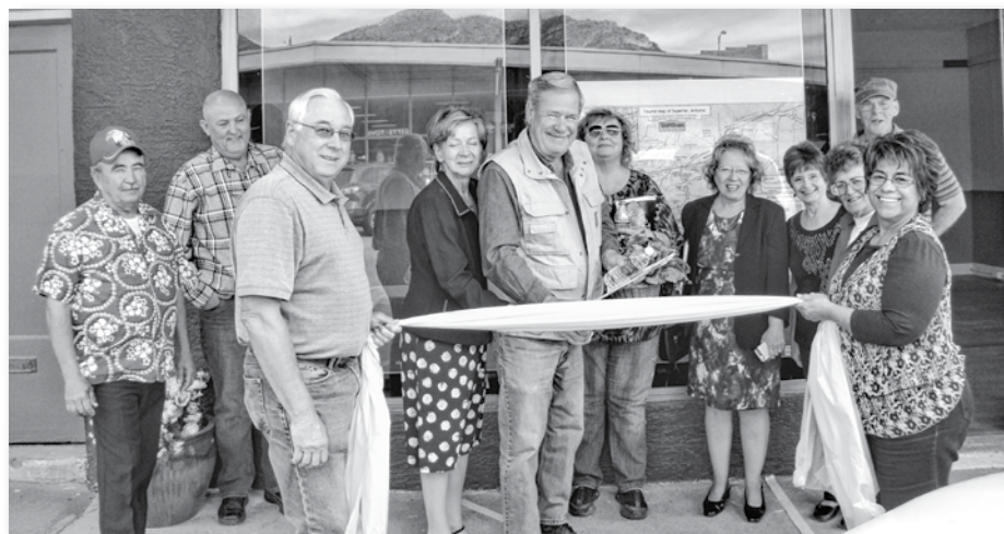
The Superior Chamber officially welcomed Old West Desert Tours to Superior.

Make yourself daily available to the Lord. Minimize the distractions around you, so that when He calls, you will be able to hear His voice. Make time in your busy schedule, to spend some quality time with God, each day. Learn to not only hear Him, but to listen to His voice. He will watch over you and keep you in the palm of His hand – provided for and protected.