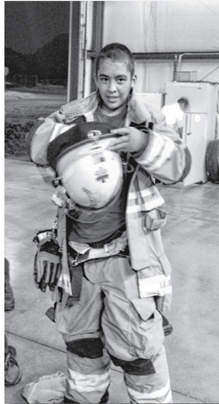
Open houses at the fire station let kids try on the profession.

On passing the physical ability test, applicants can take courses on all the