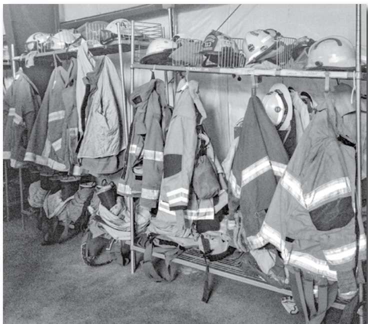
Ready to go at a moment's notice.