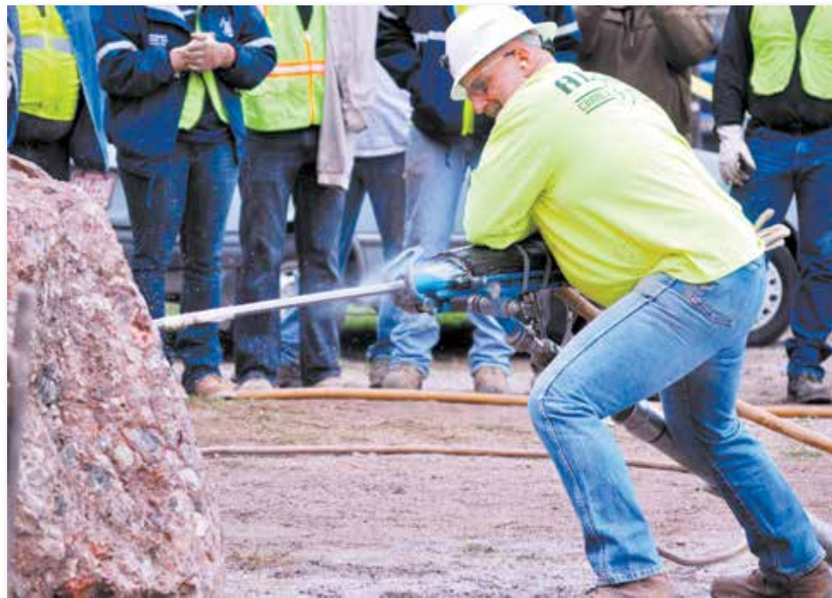
The $2,000 purse for the annual hard rock mining contest makes the Apache Leap Mining Festival popular with active and retired miners.

more information call 520-689-0200 or 602-625-3151 or visit the website at www.superiorarizonachamber.org . Watch for updates.