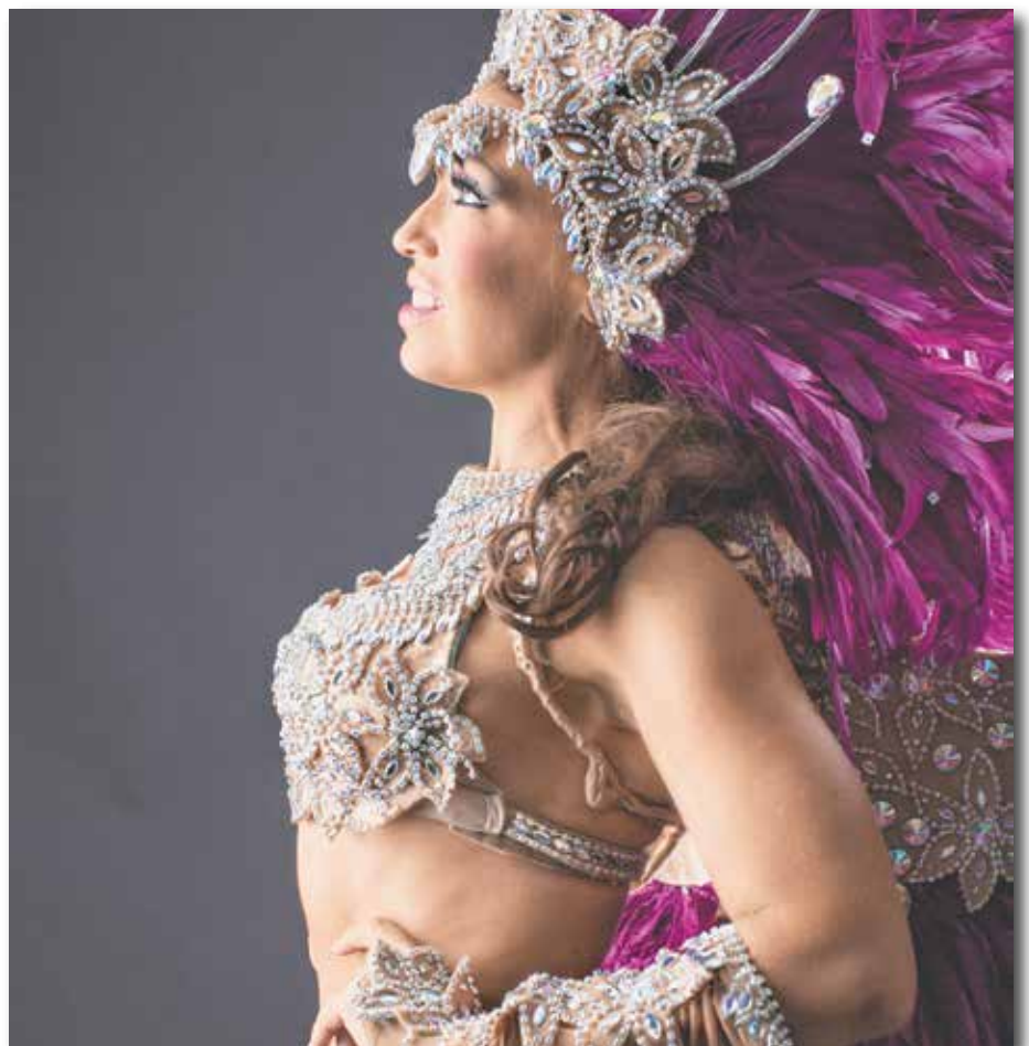
SambAz will entertain in Vegas-style costumes.

Maximum grant is $1,500 per school year ($750 per semester). Scholarships will be subsequently reviewed upon evidence that the student is meeting necessary eligibility criteria.