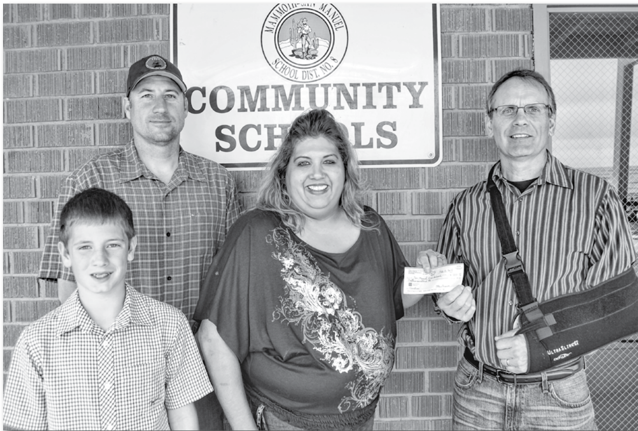
Members of the Trail Riders of Southern Arizona make a $1,000 donation to Mammoth-San Manuel Community Schools.

of the Arizona Motorcycle Riders Association (AMRA). They promote and participate in AMRA racing series events. They have close to 60 members made up of off road racing enthusiasts. They are community involved and raise money through motorcycle events that benefit non-profit organizations in southern Arizona. Besides helping San Manuel Community Schools each year, they participated in a clean up along Webb Road. The Trail Riders of Southern Arizona LLC is open to all motorcycle riders regardless of skill level. For more information visit their website www.TRSAZ.org or contact them at newmembers@trsaz.org .