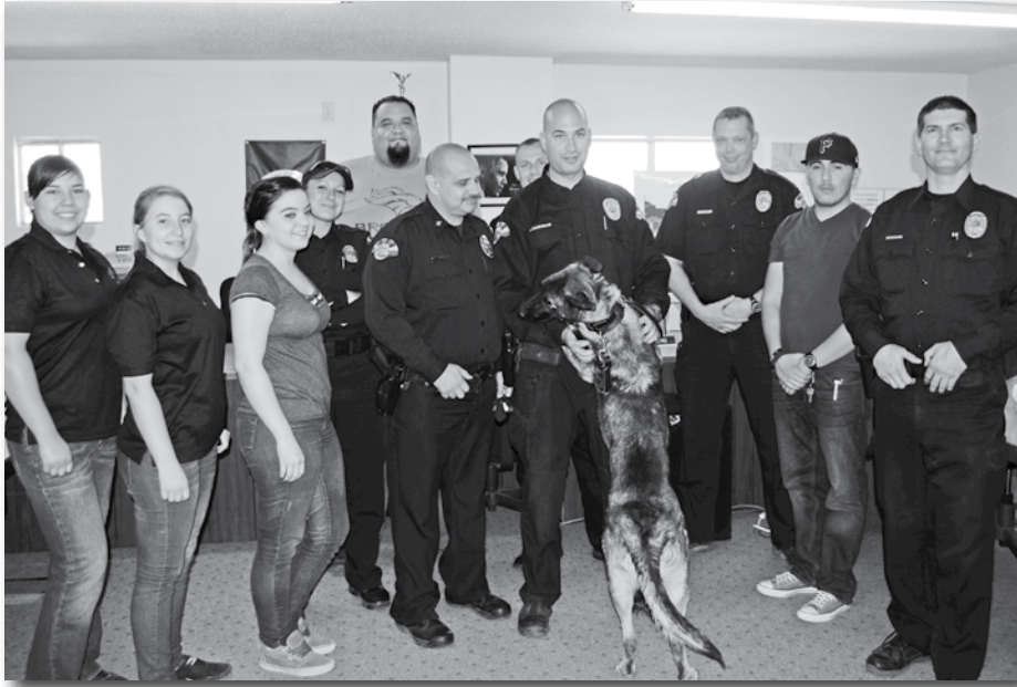
The entire Mammoth Police Department including the department's K9 Officer were on hand to congratulate the Officer and Dispatcher of the Year.