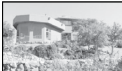
825 W CHICALOTE ST. MLS#: 21331299

Backyard oasis awaits you on this private corner lot in SaddleBrooke Ranch. Backyard abuts up to open space with views of the golf course and beautiful sunsets. Landscaping and outdoor improvements, from the fully landscaped backyard with built in custom BBQ, outdoor fireplace and pebble tech, self cleaning, auto fill, and solar cover saltwater pool. Floor plan includes light airy open kitchen with dark rich cabinets and granite countertops. Stainless steel appliances stay including washer and dryer. Den has custom built-ins from floor to ceiling. Plantation shutters, plus solar roller shades, upgraded floor tile and more. Garage has custom built-ins. $379,000