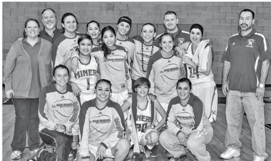
The 2013-14 Lady Miners