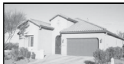
60402 E ARROYO VISTA DR. MLS#: 21329628