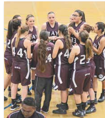
The Ray Lady 'Cats