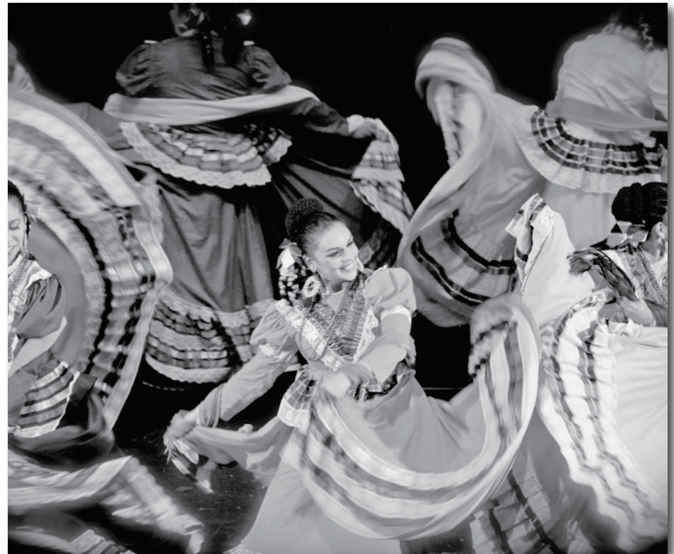
Ballet Folklórico Quetzalli de Veracruz sends their dresses swirling at a performance.

The Gold Canyon Arts Council promotes the performing and visual arts through its Canyon Sounds Artist Series. More about the organization can be found at www.gcac1.com . The council is supported in part by grants from the Arizona Commission on the Arts, Western States Arts Federation, the National Endowment for the Arts, local corporations, and businesses.