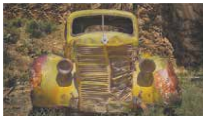
"Retired in Utah"