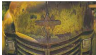
"Retired in New Mexico"