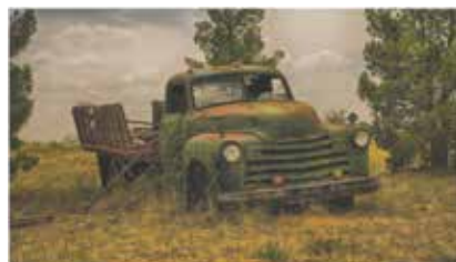
"Retired in Texas"