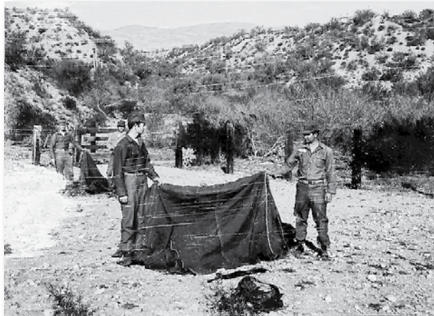
A veteran instructs a recruit on the proper way to erect a two-man tent.

The officer that was in charge of the rebuilding locomotives at this base made a statement to the Major General. He said, "This group has produced more work in the short time they have been here than I could get from my civilian employees in six months."