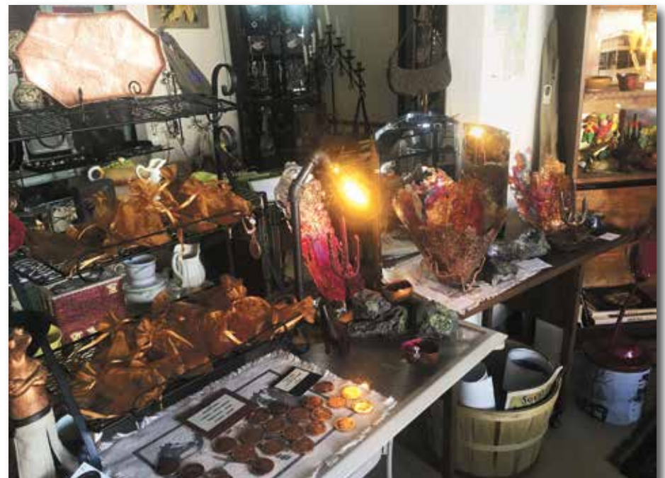
The Copper Gecko has a very eclectic collection of items for sale.

Please join us on Facebook, Twitter or Instagram.