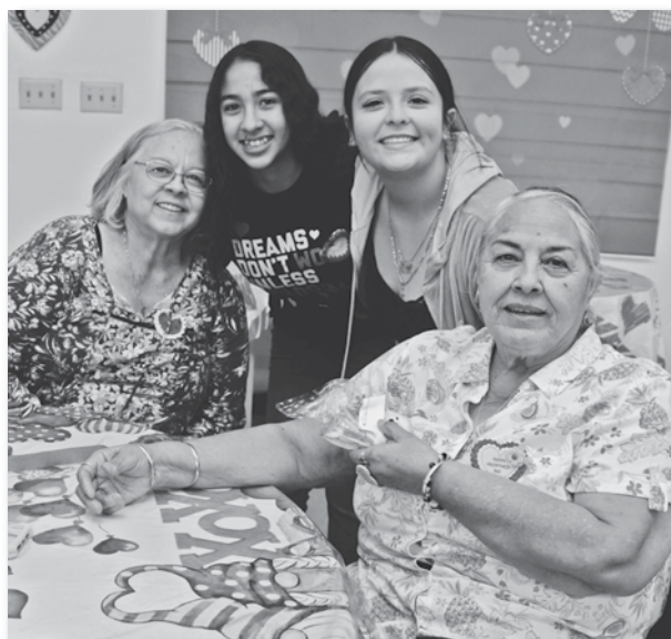
Volunteers share cookies with senior citizens.