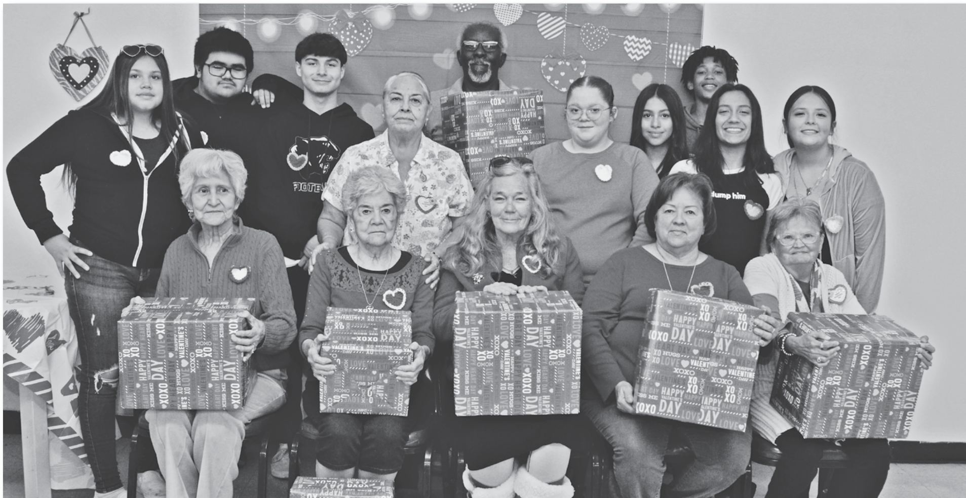
Superior Junior/Senior High School student volunteers pose with the game winners and their prizes.