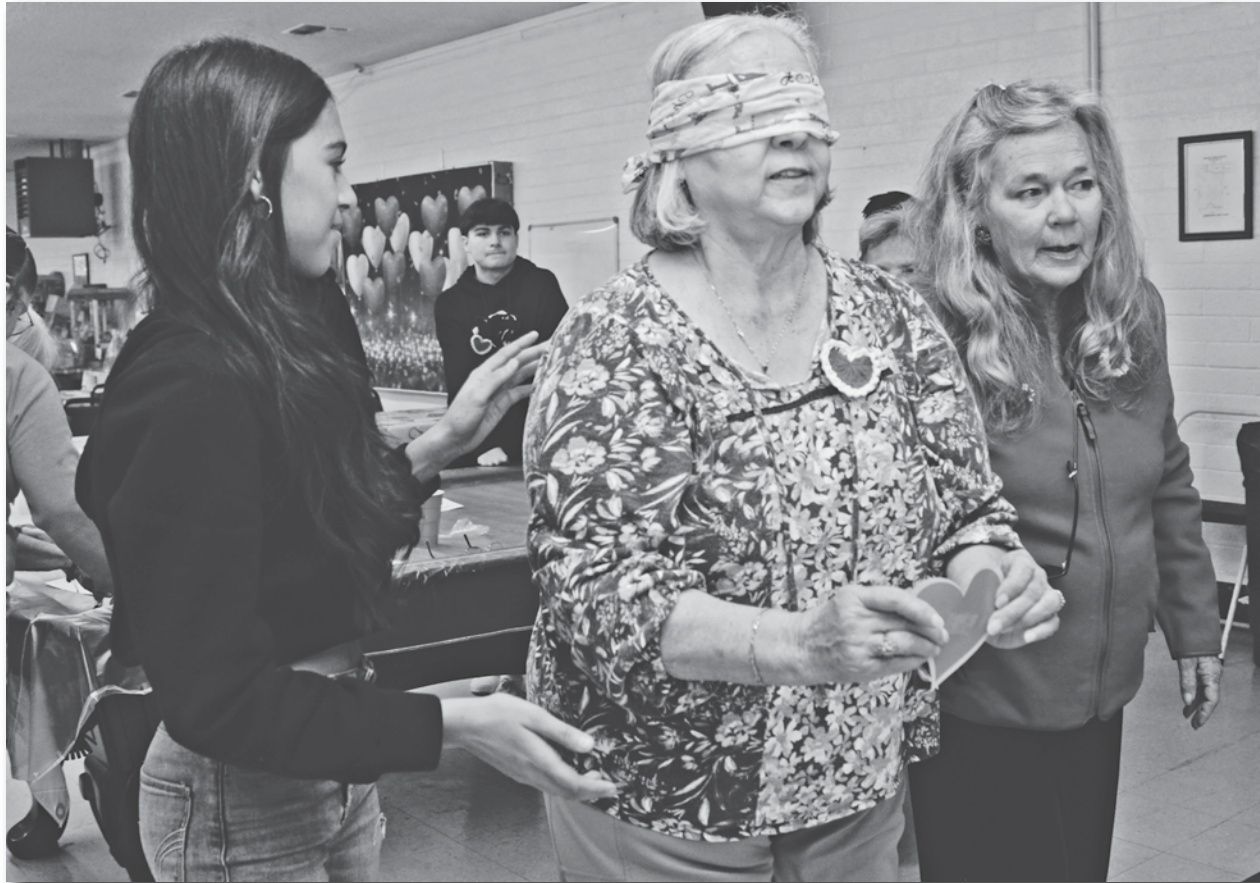
Playing games at the Superior Senior Center Valentine's Day party.