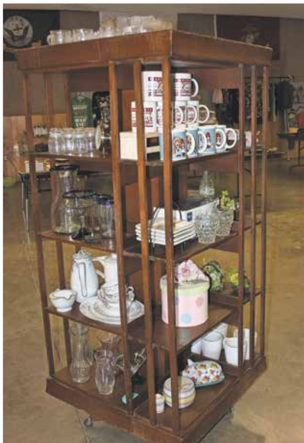
Some of the many items at the rummage sale.