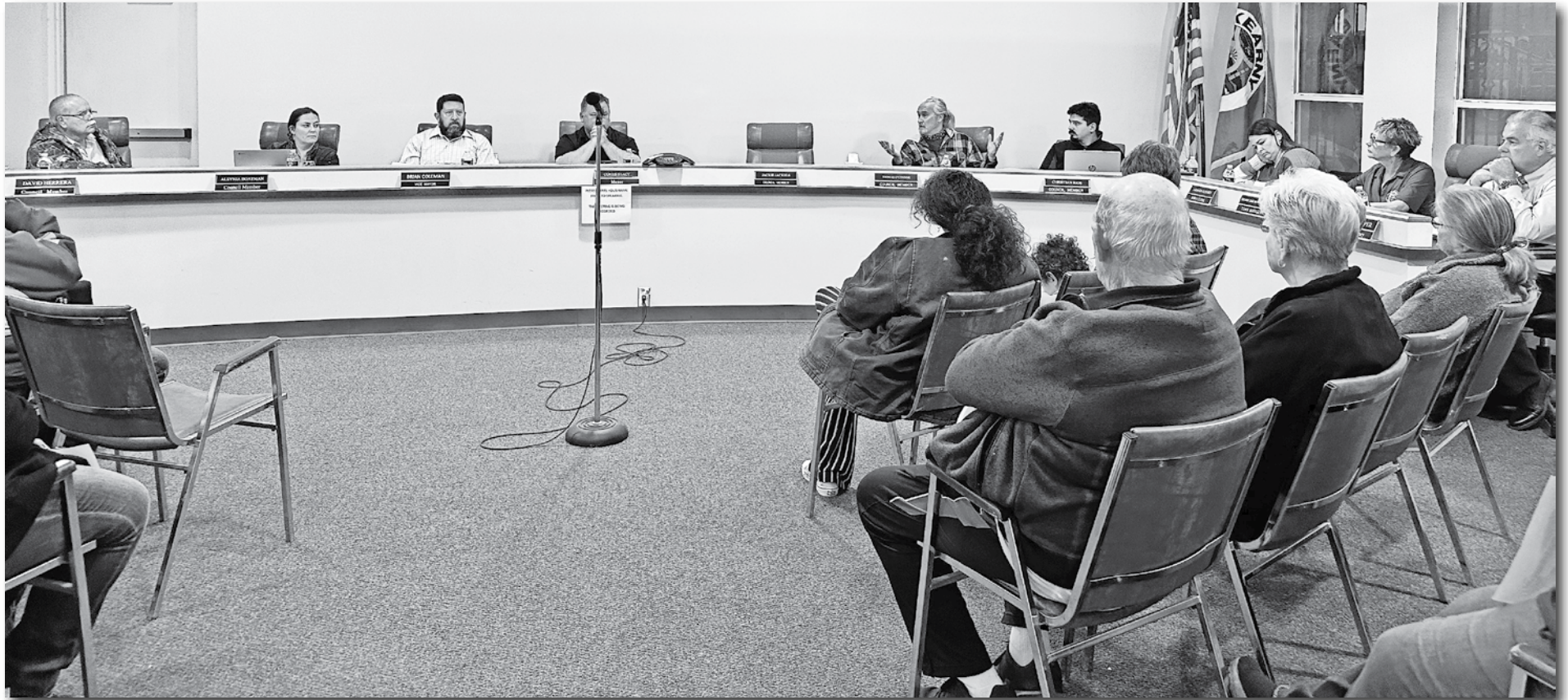
The Kearny Council debates the fate of the town manager at a special meeting last week. The council chambers were packed with interested residents.