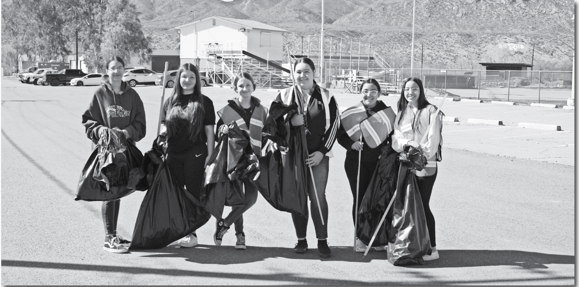
Copper Basin Junior Chamber of Commerce members along with Queen and Junior Queen candidates were busy Saturday morning cleaning up the area on Emery Dr. in Kearny.