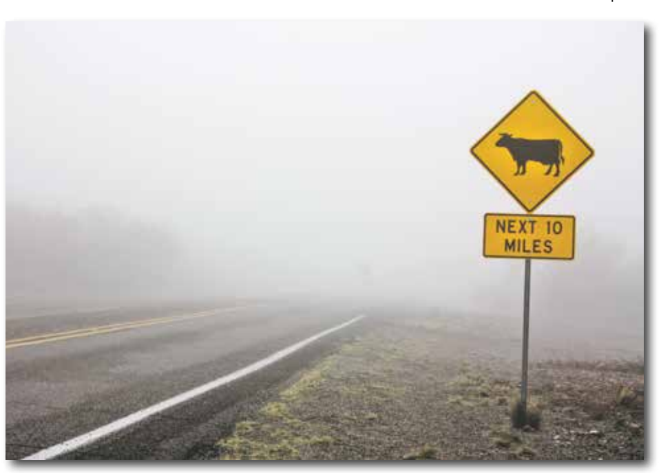
Rainstorms late last week brought in the eerie fog to the Copper Basin. Visibility was very limited Saturday morning until the sun finally burned off the fog.