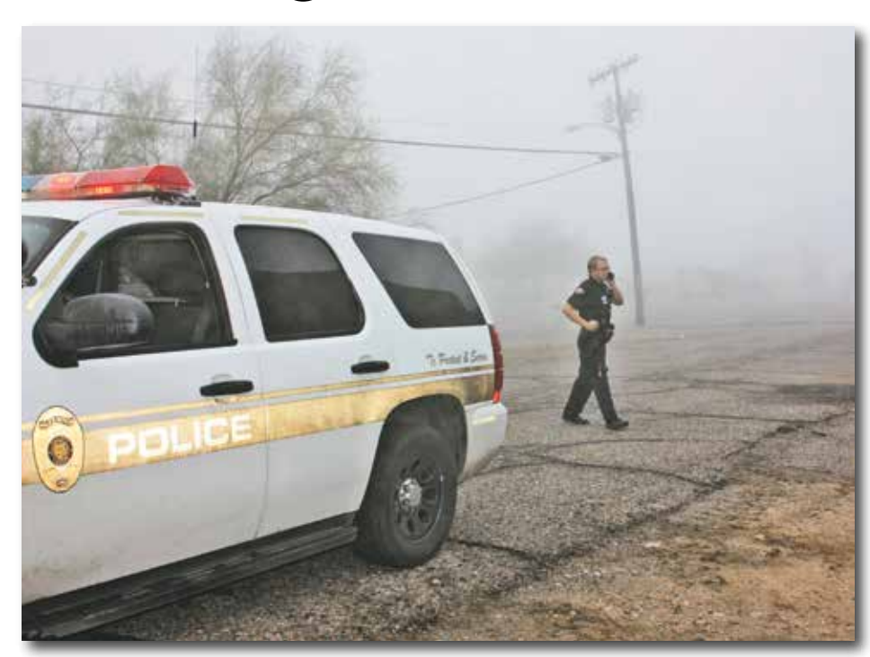
A Kearny Police Officer keeps the public away from a dangerously leaning power pole at Ray Schools on Saturday. Fog hindered crews working on the pole. Power was out in the area until APS replaced the damaged pole.