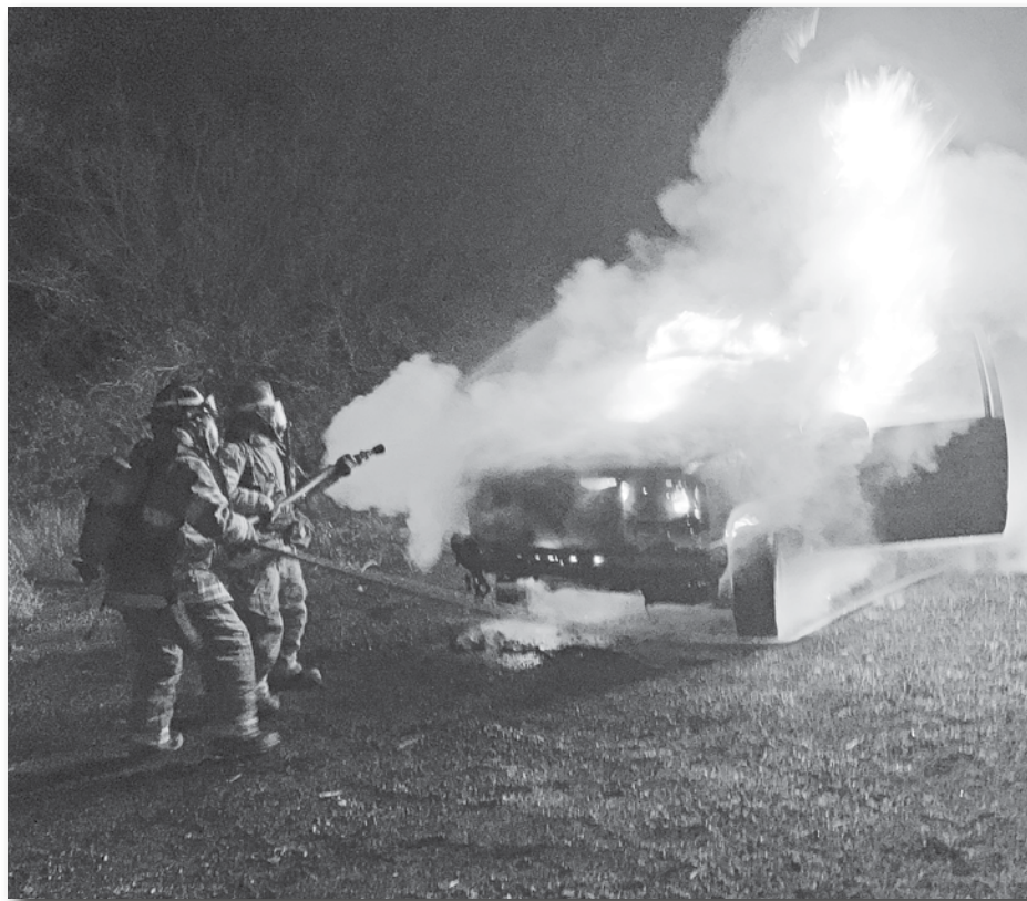
On Friday night, Feb. 15, 2019, at 8:12 p.m., Pinal Rural Fire and Medical District responded to the scene of a car fire on SR 77 approximately four miles north of Mammoth. Firefighters successfully extinguished the blaze. There were no injuries. Bobby Apodaca | Submitted