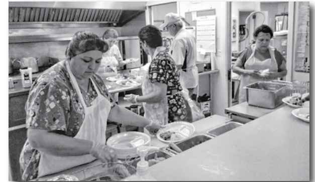
Senior center staff prepares meals for the Valentine's Day party.