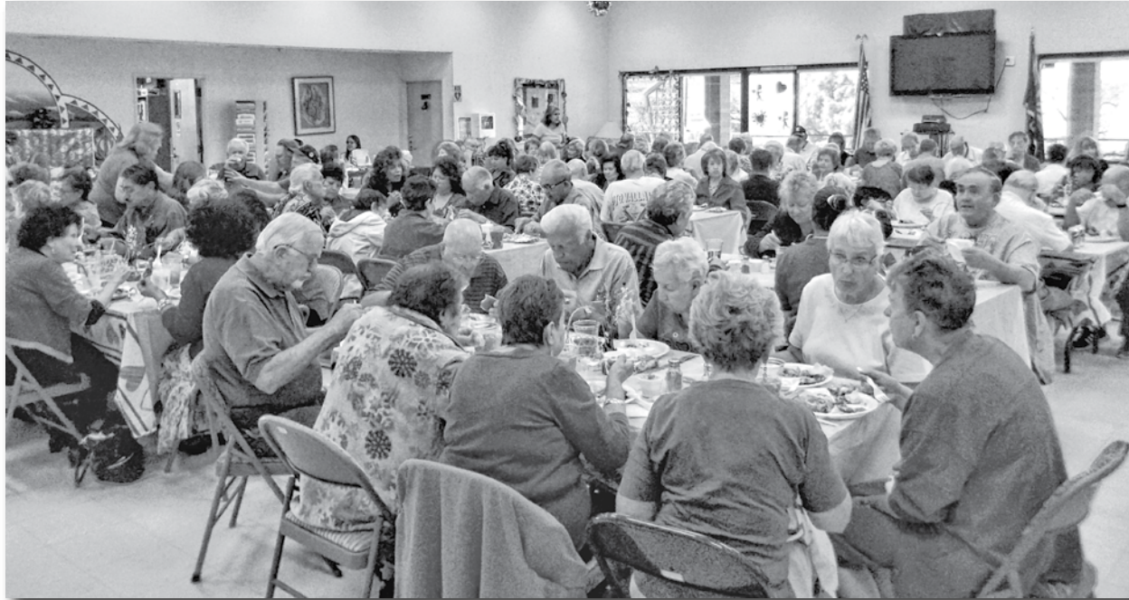
Good company and good food, the Hayden Seniors celebrate Valentine's Day.

The Hayden Senior Center provides many events throughout the year including an Easter Luncheon, Mother and Father's Day Luncheon, Thanksgiving Luncheon and Christmas Luncheon. For more information about upcoming events feel free to contact the Hayden Senior Center at 520-356-7035.