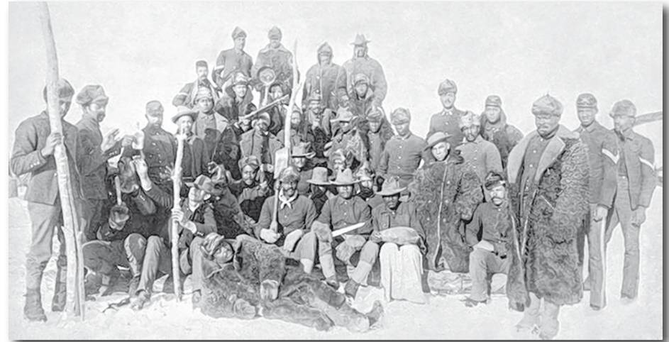
The 25th Infantry – Buffalo Soldiers

The Buffalo Soldiers would fight in the Indian Wars on the Great Plains and in the southwest. They would also fight in the Spanish American War, the Philippine Insurrection, World War I and World War II. They policed the National Parks before there were park rangers and patrolled the Mexican Border before the Border Patrol was formed. They participated in the hunt for Pancho Villa under General John "Black Jack" Pershing who would become general of the armies in World War I. Pershing got his nickname of Black Jack from serving as a Lieutenant in the 10th Cavalry. He was known to praise the black troops and treated them with professionalism. While teaching at West Point, Pershing was unpopular with the cadets because he was a strict disciplinarian. The cadets and other military officers knew of Pershing's service commanding black troops. They took to calling him "N****r Jack", a racial slur behind his back. It would be softened