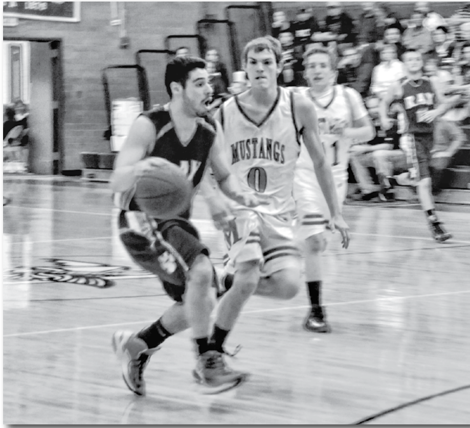
The Bearcat cagers lost a close one to the Mogollon Mustangs, 72-76.