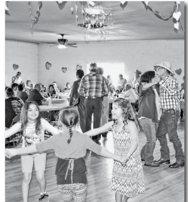
Youth dancing and enjoying themselves at the fundraiser.