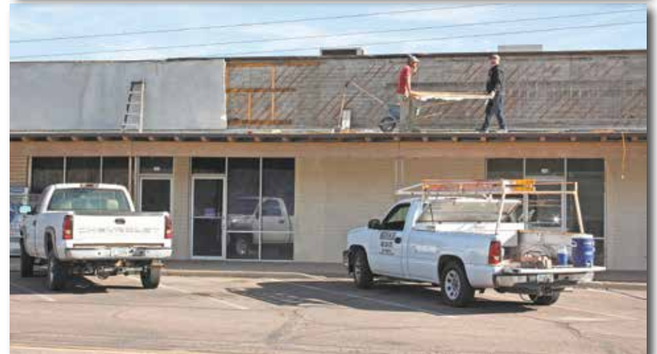
Old stucco from the front of the Kearny Innovation Retail Center is being removed this week. New stucco will be done soon. Doing the work are workmen from Construction Done Right, a local Kearny contractor.