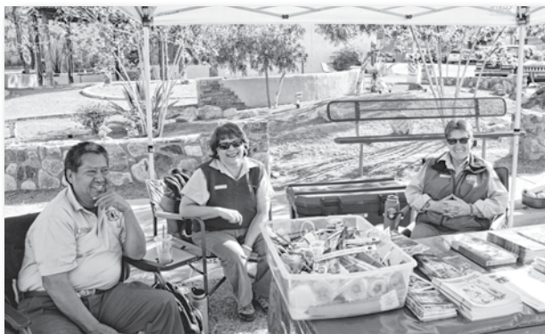
Representatives of the U.S. Forest Service.