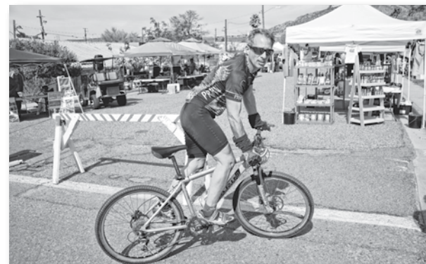
A bicyclist at the LOST Fest.