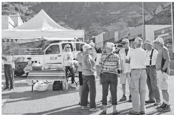
Hikers gather before leaving on a guided walk.