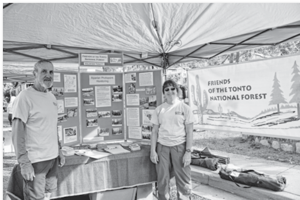
Friends of the Tonto National Forest.