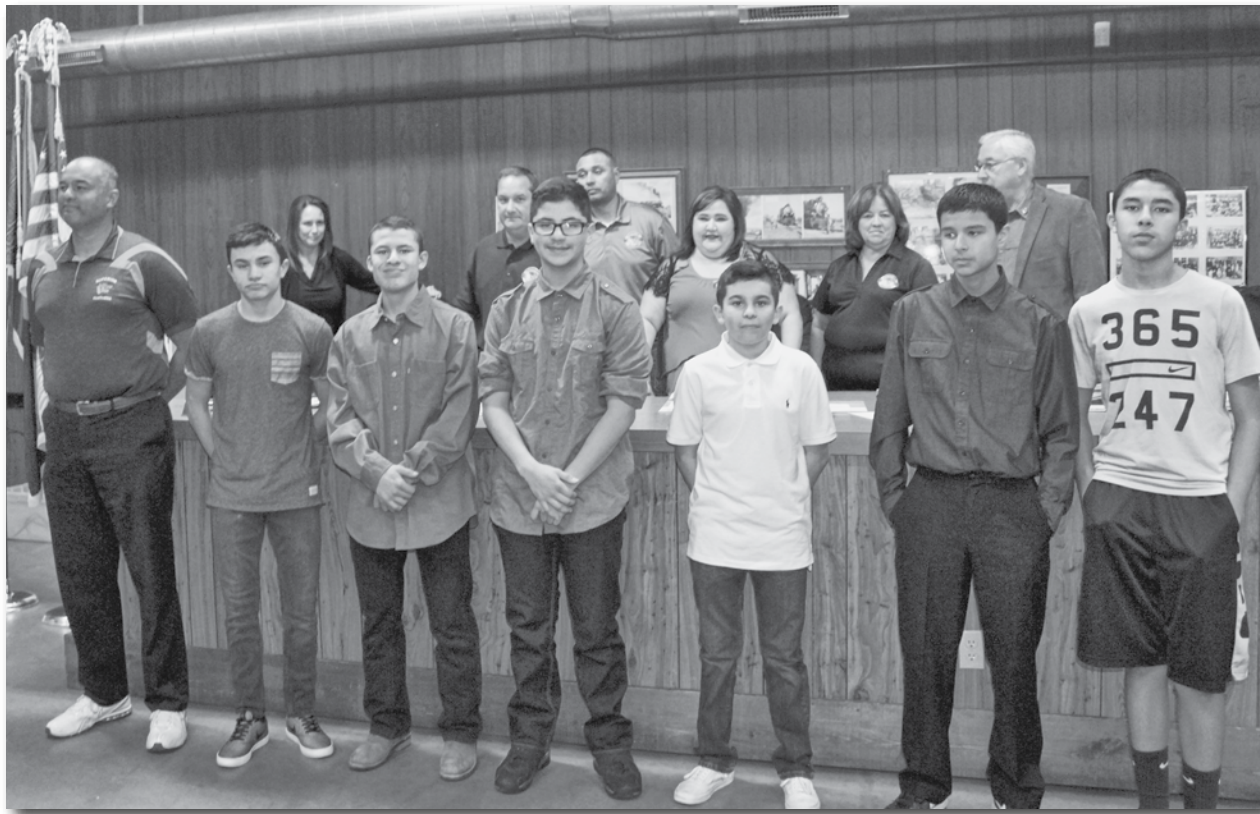
The 8th grade boys basketball team standing the council and the public as they applaud their recent championship.