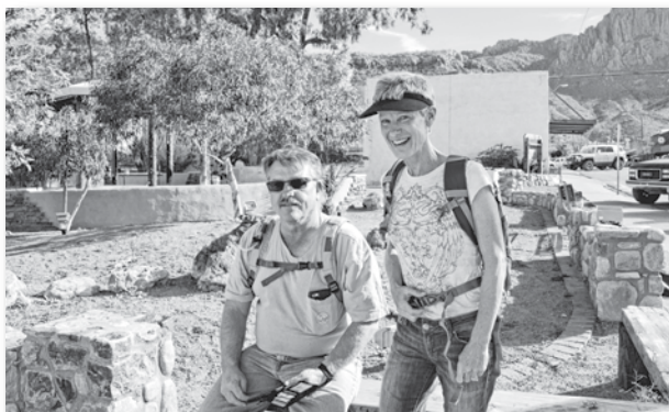
More hikers at the LOST Fest. About 150 attended.