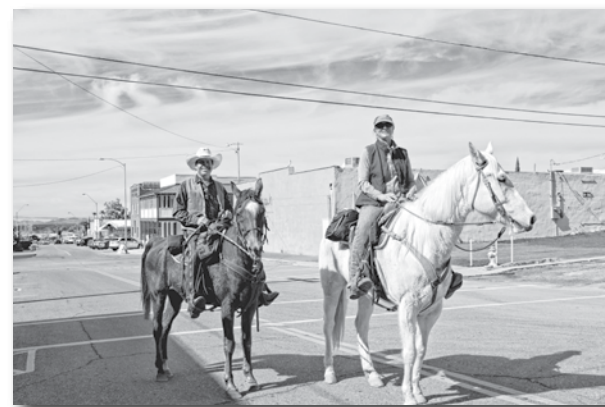
Equestrians at the LOST Fest.