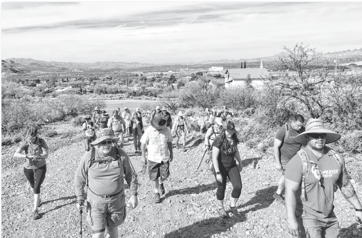
Hikers walk the popular trail to the cross above Superior.