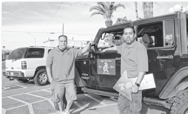
Jeep tours were offered by Superior Tierra Rentals.