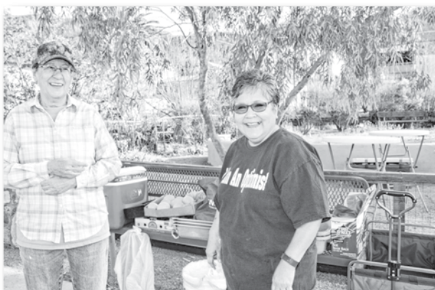
Superior Optimists prepare hamburgers for sale.