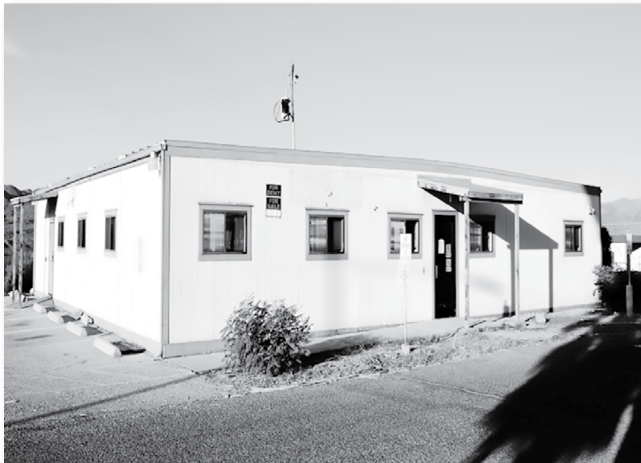
The new DES building in Kearny.