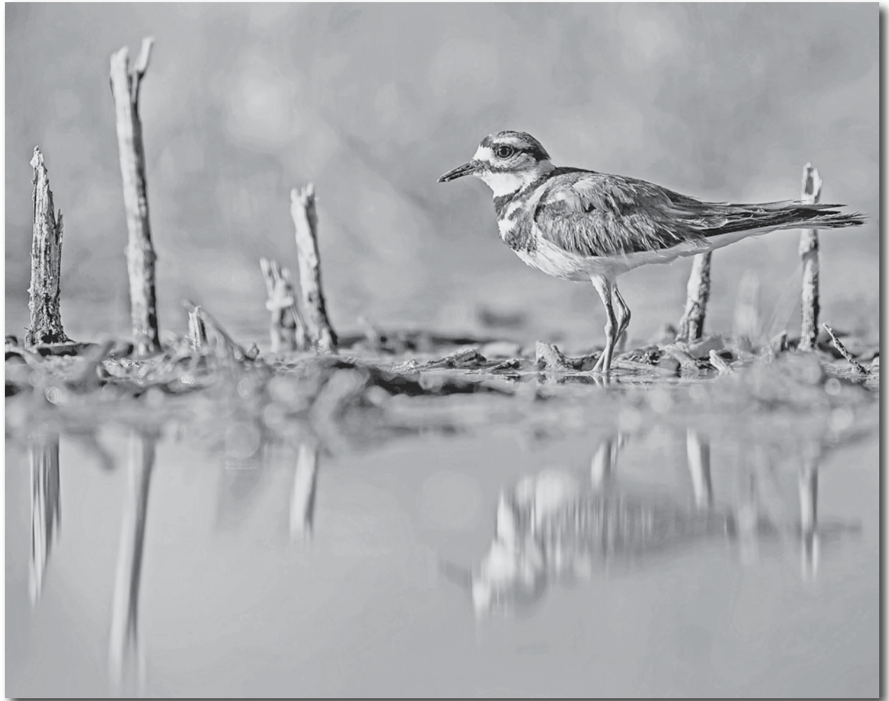
Photo from the most recent (2019) contest winner, Sean Stubben. Photo courtesy Arizona Highways Magazine

The Kearny Police Department would like to remind the community that it is a violation of Town Code 10-1-13.A to any person to obstruct any public street or alley, sidewalk or park or other public grounds within the town by committing any act of, or doing anything with is injurious to the health, or indecent or offensive to the senses, or to do in or upon any such streets, alleys, sidewalks, parks or other public grounds, any act or thing which is an obstruction or interference to the free use of property or with any business lawfully conducted by anyone, in or upon, or facing or fronting on any such streets, alleys, sidewalks, parks or other public grounds in the town. The Town Code covers any object that would block the sidewalks within the town such as portable basketball hoops. Please be mindful of this Town Code and remove any objects that are currently blocking any portion of the sidewalks. Kearny Police Department would like to thank you for your assistance.