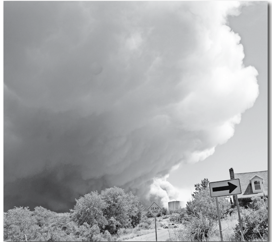
A smoke plume rises over Oracle during last summer's Bighorn Fire.