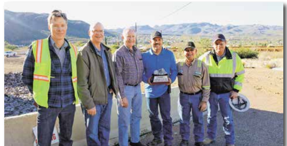
The 2015 Supplier of the Year was awarded to Oddonetto Construction of Globe, AZ.

Visit them online at www.resolutioncopper.com . Follow @resolutioncu on Twitter.