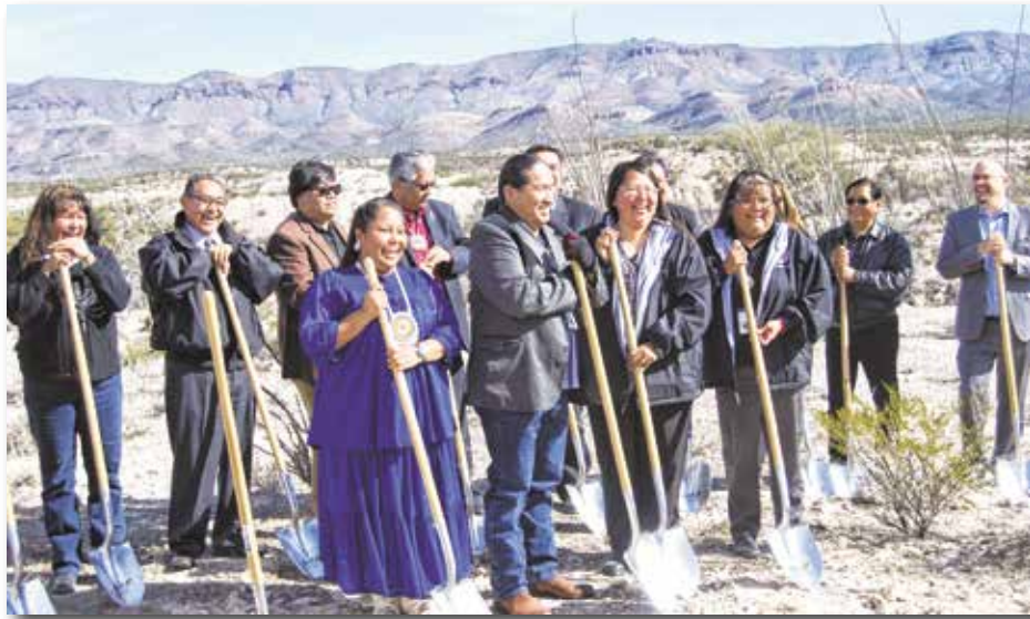
Leaders from the San Carlos Apache Tribe as well as local leaders officially broke ground last week on the Apache Sky Casino near Dudleyville. They plan to open in June.