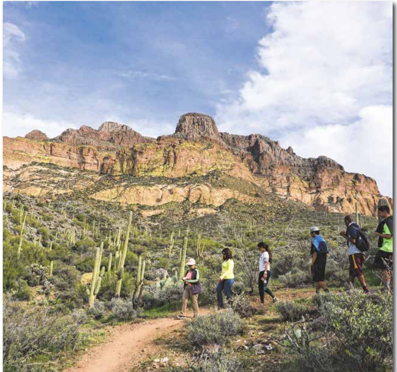
LOST Fest is this weekend in Superior. Why not get out and take a hike?