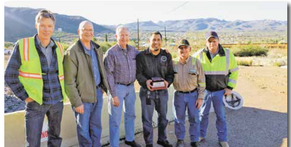
The 2015 Small Business Supplier of the Year was awarded to Superior Environmental of Superior, AZ.