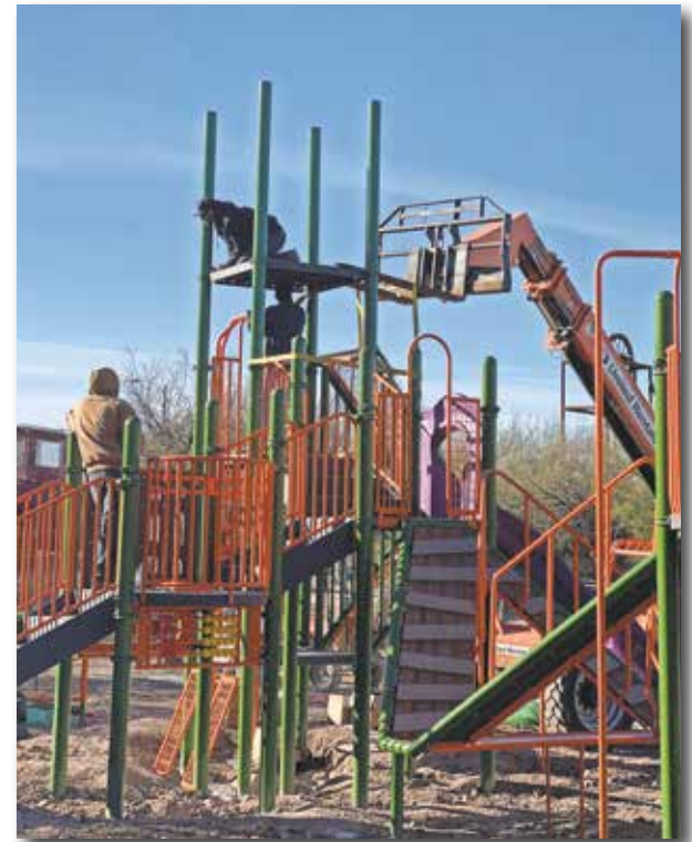
The new playground at the US 60 Park in Superior is under construction. The Grand Opening is set for Jan. 18.