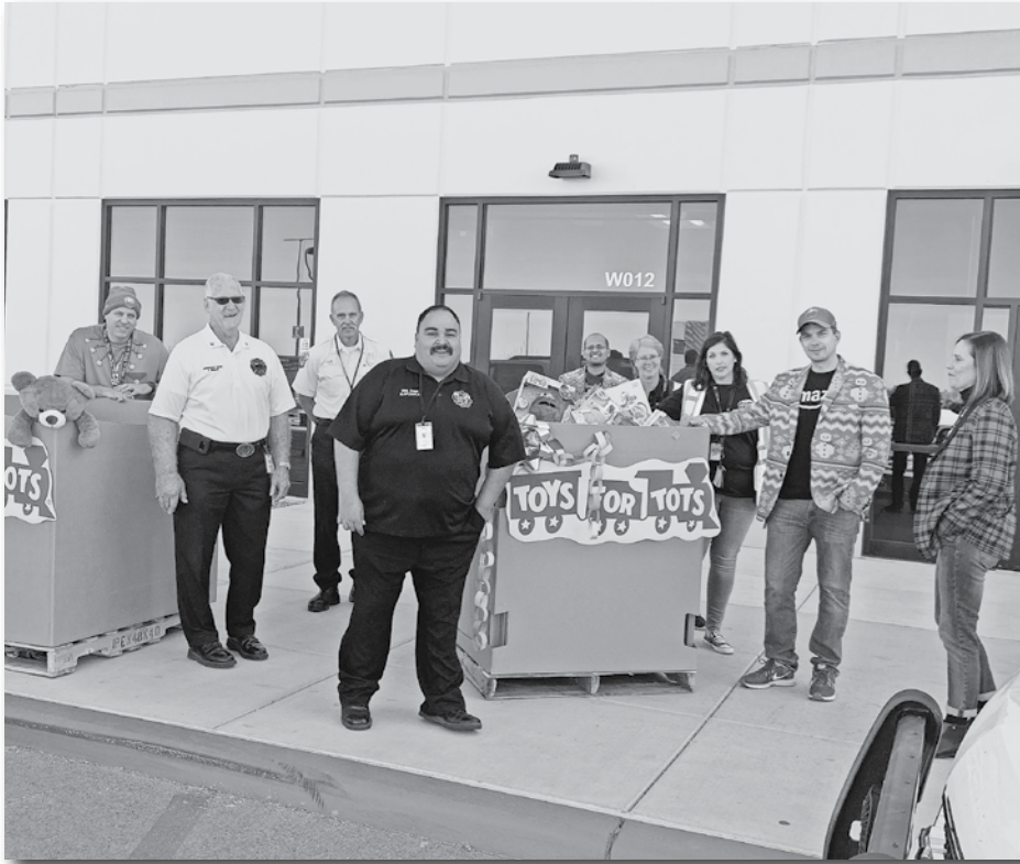
Pinal Rural Fire & Medical District personnel received a large donation of toys from Amazon as part of the Toys for Tots program. The toys were distributed to local children, some of whom are affected by the months-long strike at Asarco.