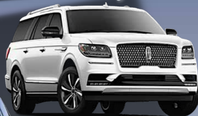
2020 Lincoln Navigator Reserve in Blue Diamond stock # 14008