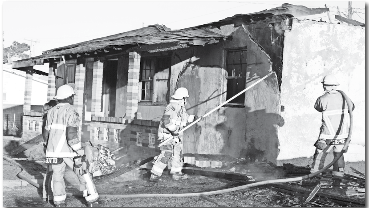
Kearny Firefighters, with assistance from Superior, make certain that all flames are out after a house fire on New Year's morning.

Fire investigations can take several weeks to finalize, so exact details were not available at press time.