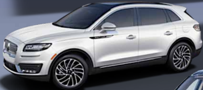
2019 Lincoln Nautilus Reserve in White Platinum stock # 13747