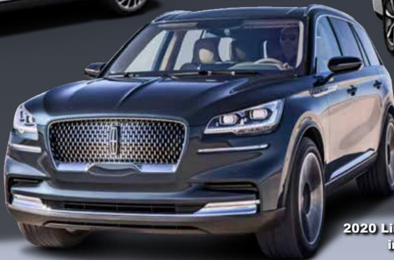
2020 Lincoln Aviator Reserve in Blue Diamond stock # 13951