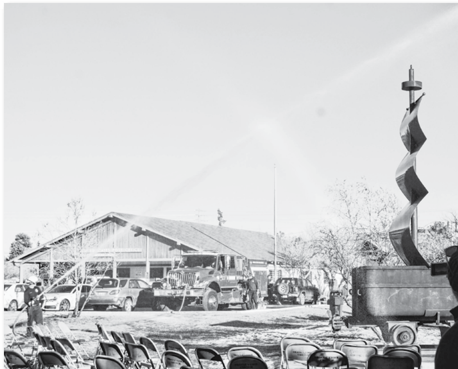
The Oracle Fire Department christened the newest Ore Cart on the Ore Cart Trail with an arc of water.