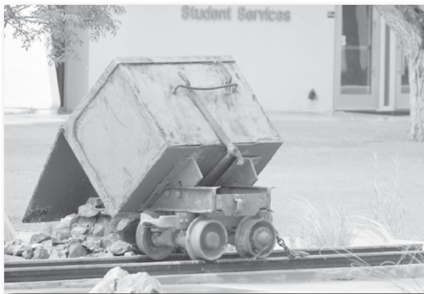
The Aravaipa campus of Central Arizona College is a close option for college students.