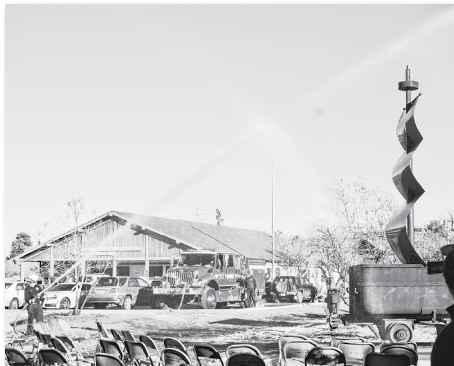
The Oracle Fire Department christened the newest Ore Cart on the Ore Cart Trail with an arc of water.