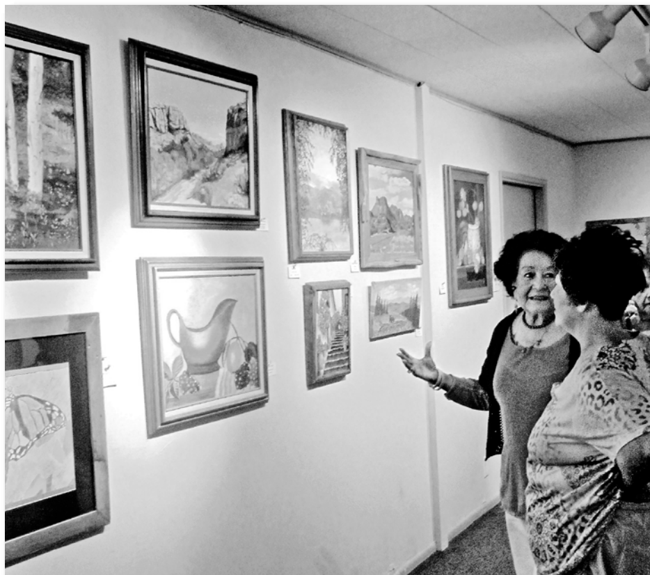
Just a sampling of the work produced by the ArtUs Guild as shown during the annual show held in the spring.