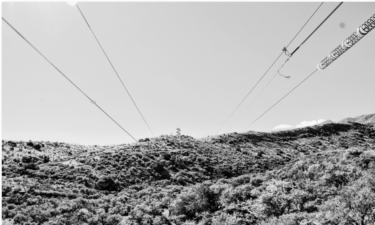
Looking up to the 30 ft. tower of the 1,500 foot run on the Arizona Zipline Adventures.