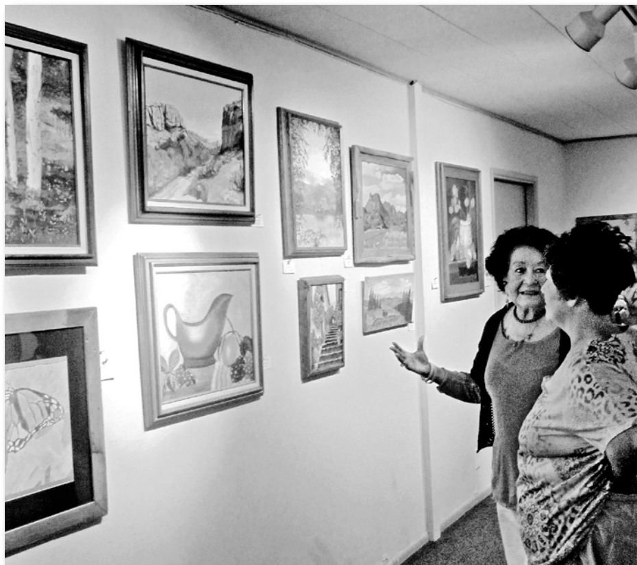
Just a sampling of the work produced by the ArtUs Guild as shown during the annual show held in the spring.