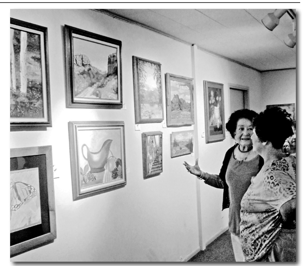
Just a sampling of the work produced by the ArtUs Guild as shown during the annual show held in the spring.

During the period of Dec. 28 and Jan. 3 there were six ambulance runs one 911 open line and two alarm drops.