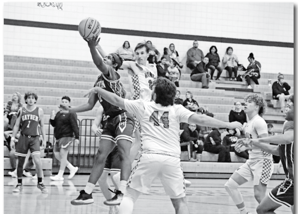
Hayden competes against the Miami Vandals in the Lost Dutchman Tournament in Apache Junction.