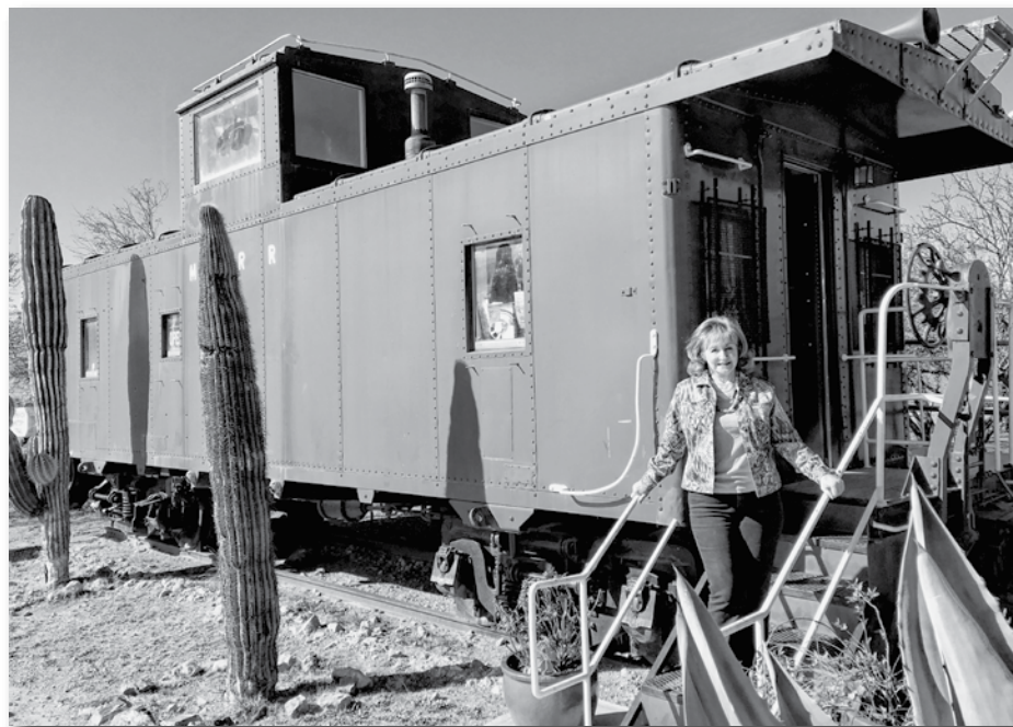
Superior Caboose Visitor Center located on Highway 60 within the US 60 Park.