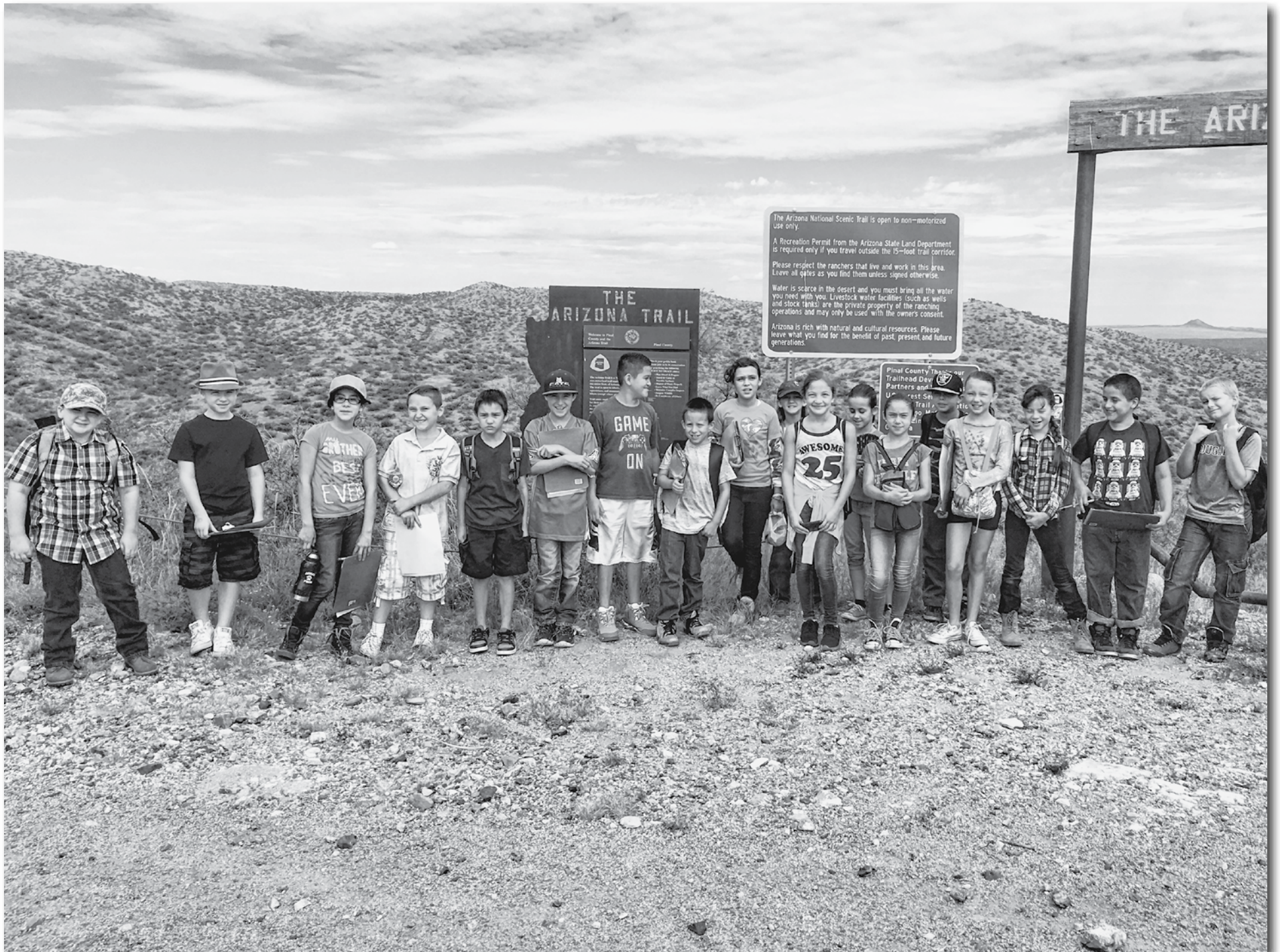
Mountain Vista 4th graders working on the Arizona Trail.

Mammoth and San Manuel are gateway communities of the Arizona Trail. The mission of the program "is to provide educational and meaningful outdoor experiences that empower youth to become the next generation of stewards of Arizona's wild landscapes". Over 1200 kids have participated so far and the program is growing. Elementary, middle school and high school students can