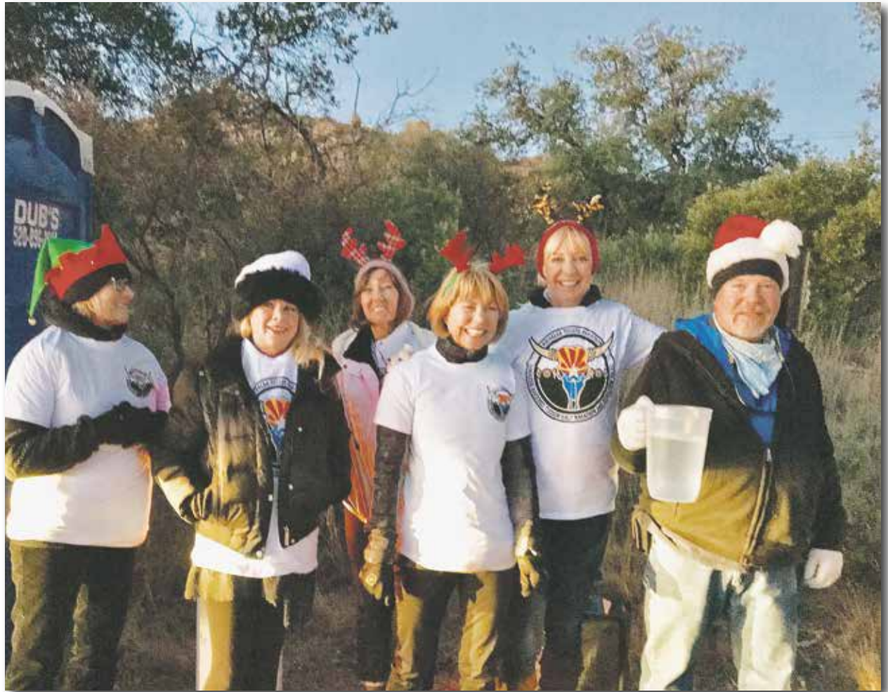
Volunteers from OWN Oracle at the Tucson Marathon, ready to serve water to the runners. The group has been volunteering for several years at the early December event.