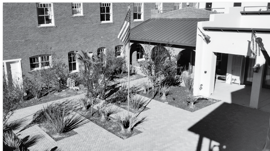
A view of the courtyard at the Magma Hotel.