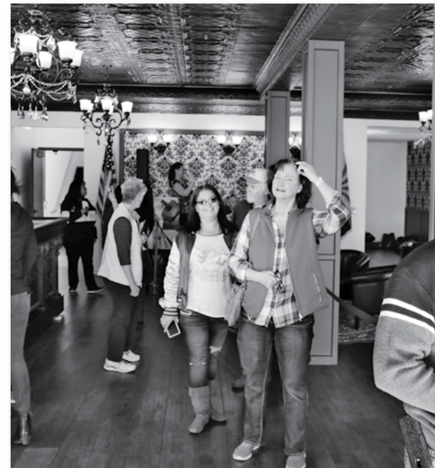
Touring the newly renovated Magma Hotel.