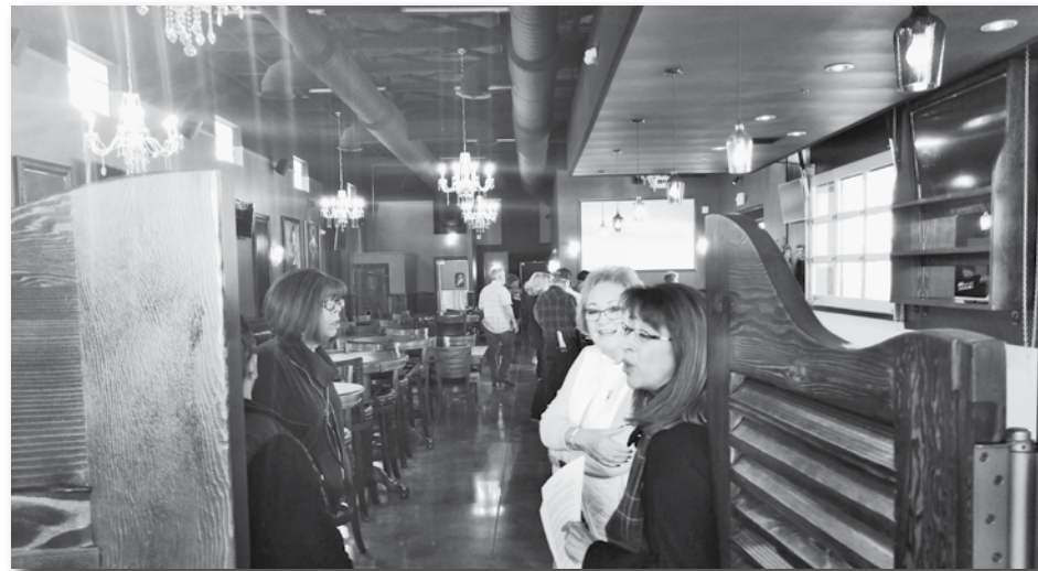
Touring the new Barmacy.