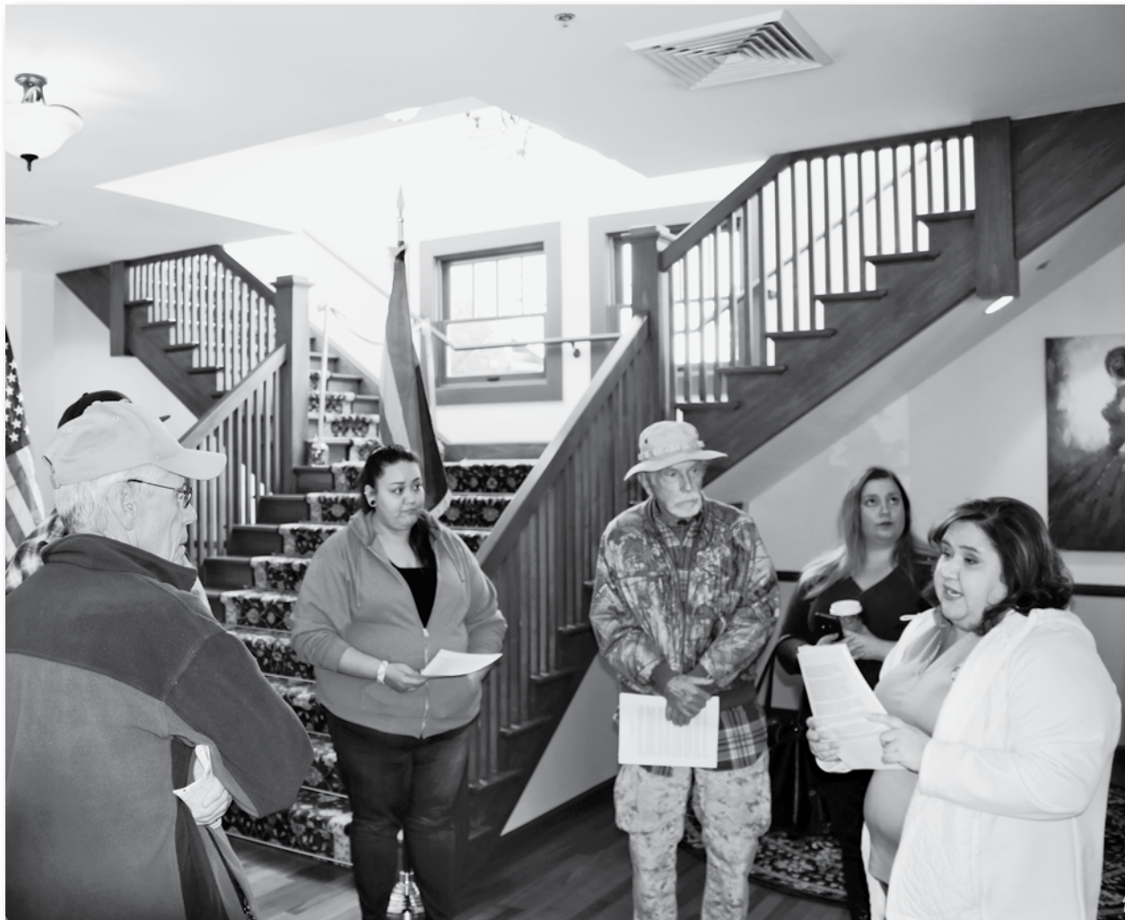
Superior Mayor Mila Besich volunteering at the Magma Hotel.