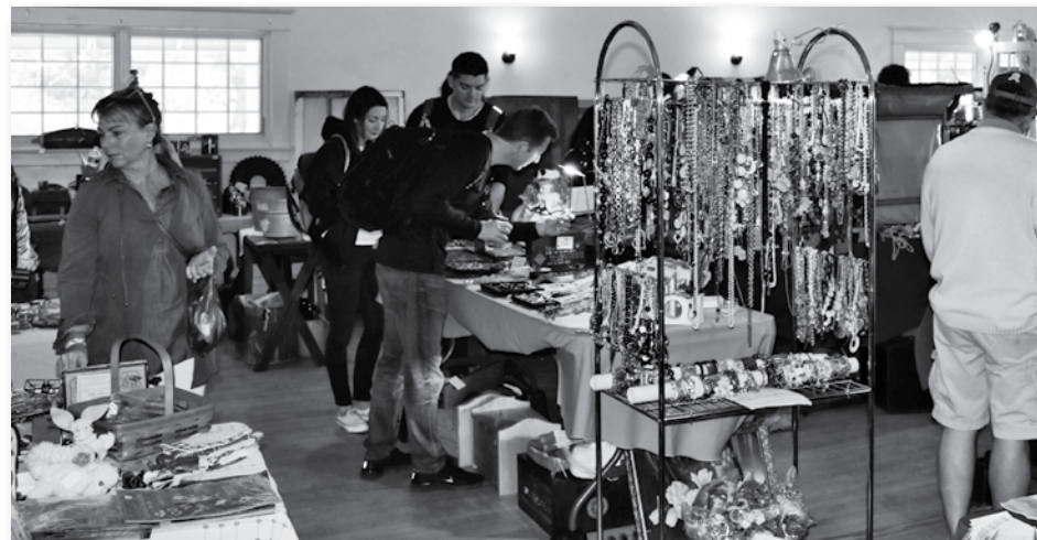
The antique show at the Magma Club.