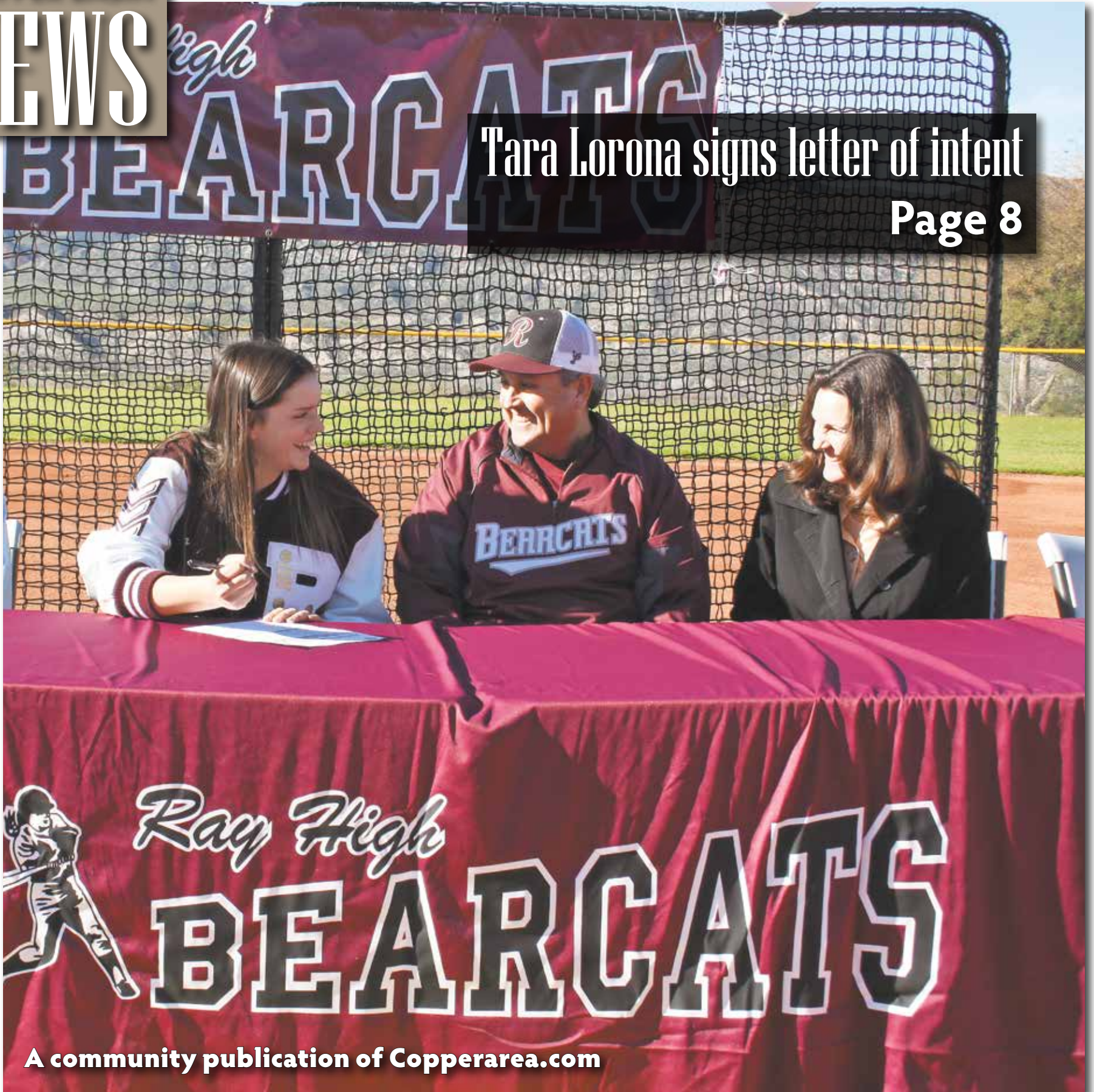
James Carnes | Copper Basin News